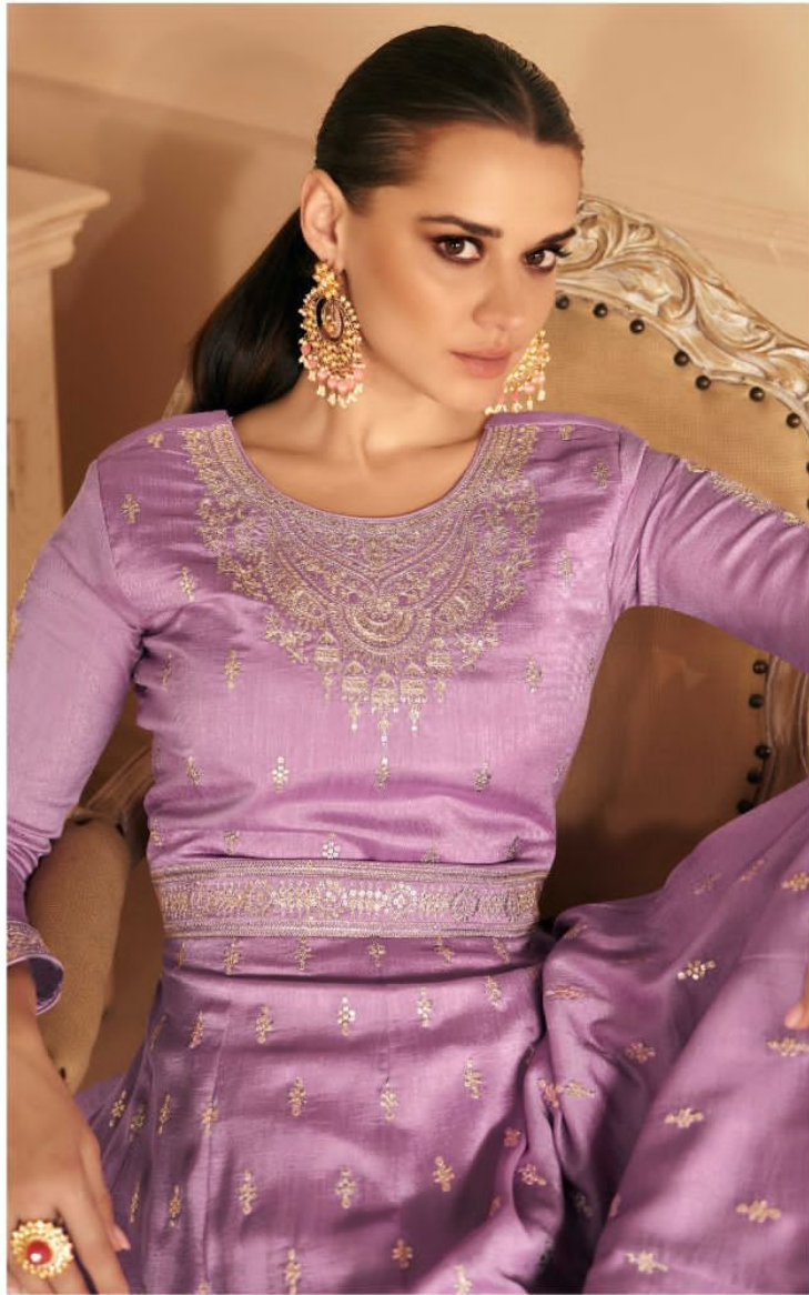
A - 9636