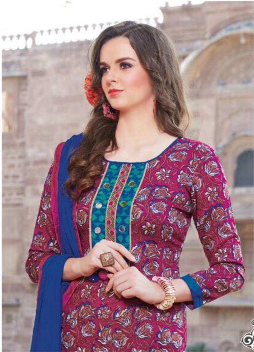
Design for beautiful lady her dreams in fashion, dream a word can give inspiration to us our dream is to create excellent designs for beautiful lady