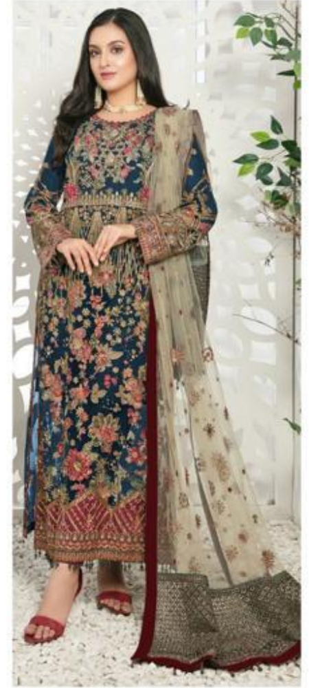
D.NO. - 4003