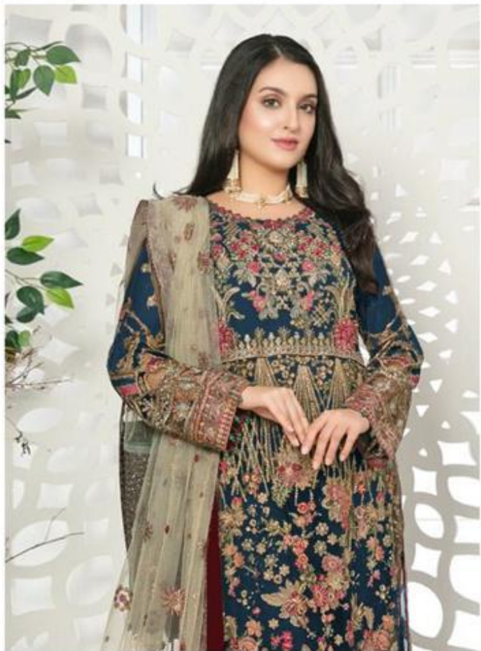
D.NO. - 4003