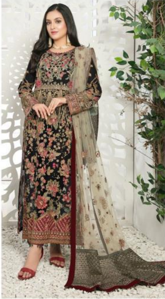
D.NO. - 4001