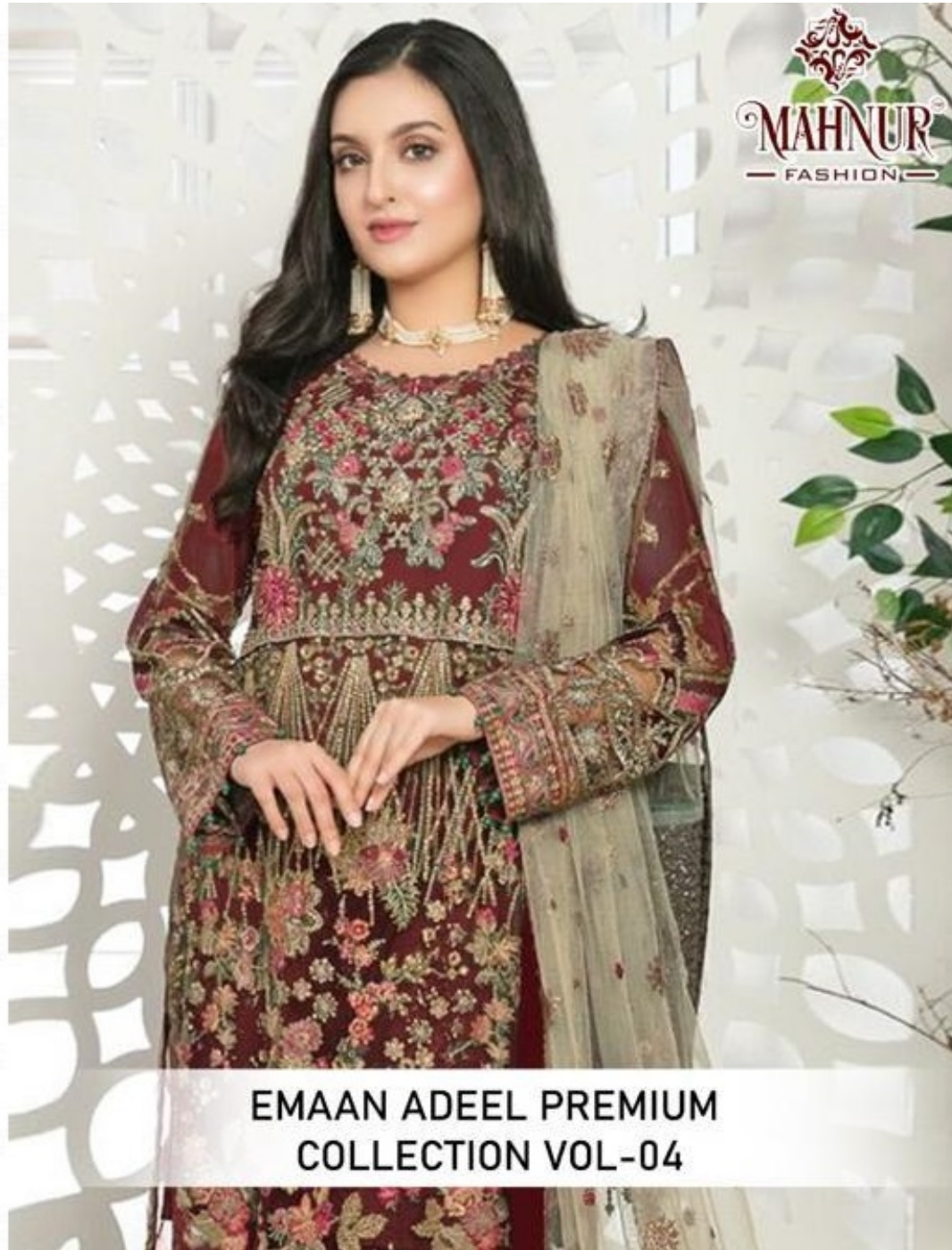
EMAAN ADEEL PREMIUM COLLECTION VOL-04