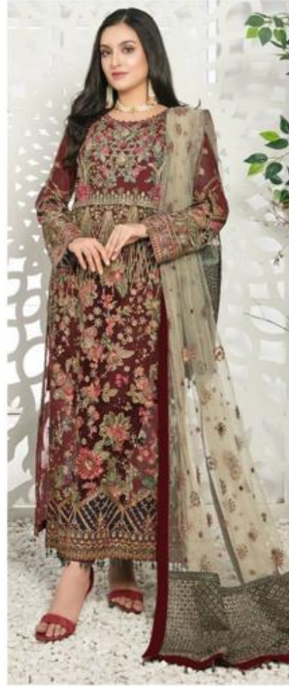
D.NO. - 4002