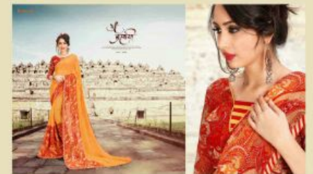
D.no. - 2060