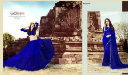
D.no. - 2052