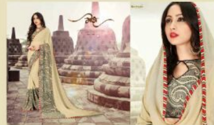
D.no. - 2065