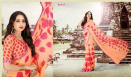
D.no. - 2054