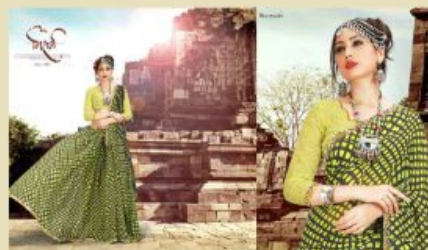
D.no. - 2064