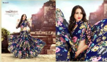
D.no. - 2061