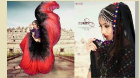
D.no. - 2068