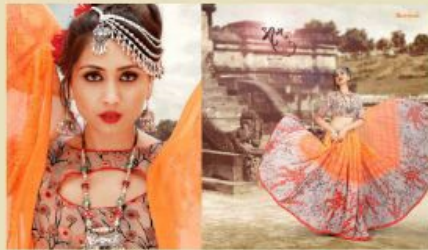
D.no. - 2063