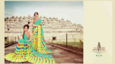
D.no. - 2057