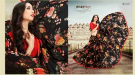
D.no. - 2066