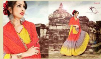
D.no. - 2056