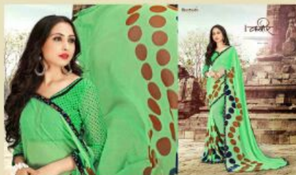
D.no. - 2053