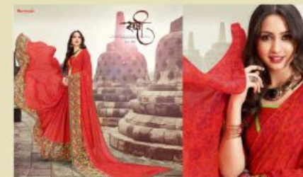
D.no. - 2058