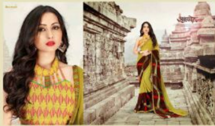
D.no. - 2051