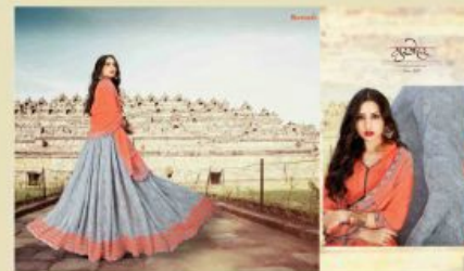
D.no. - 2059