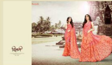
D.no. - 2067