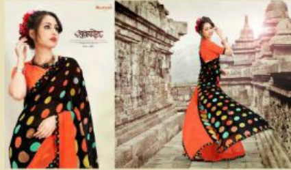
D.no. - 2062