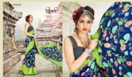
D.no. - 2055