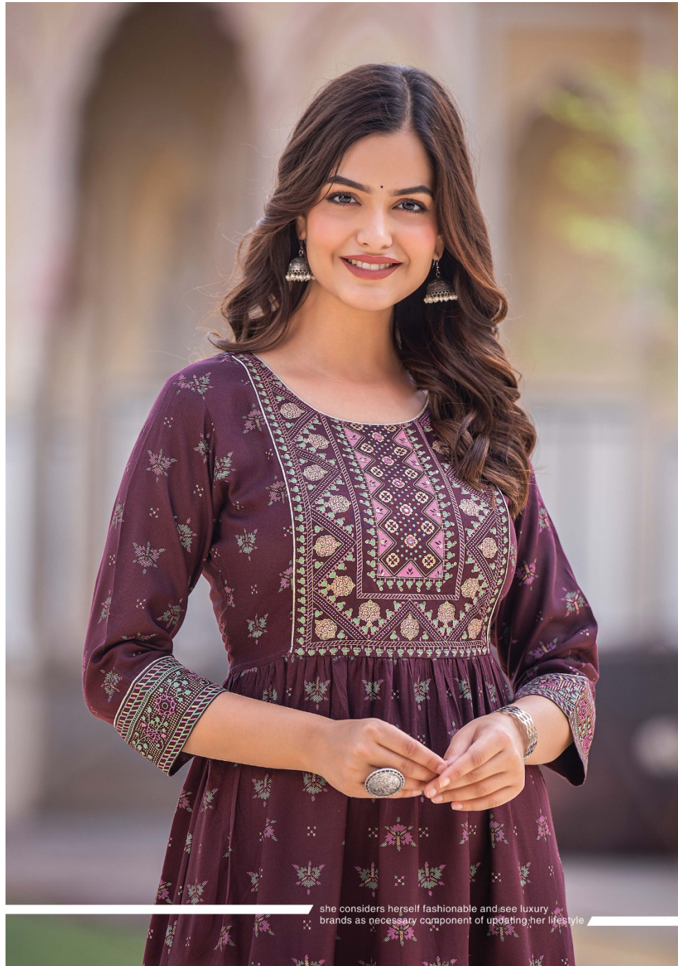
she considers herself fashionable and see luxury brands as necessary component of updating her lifestyle