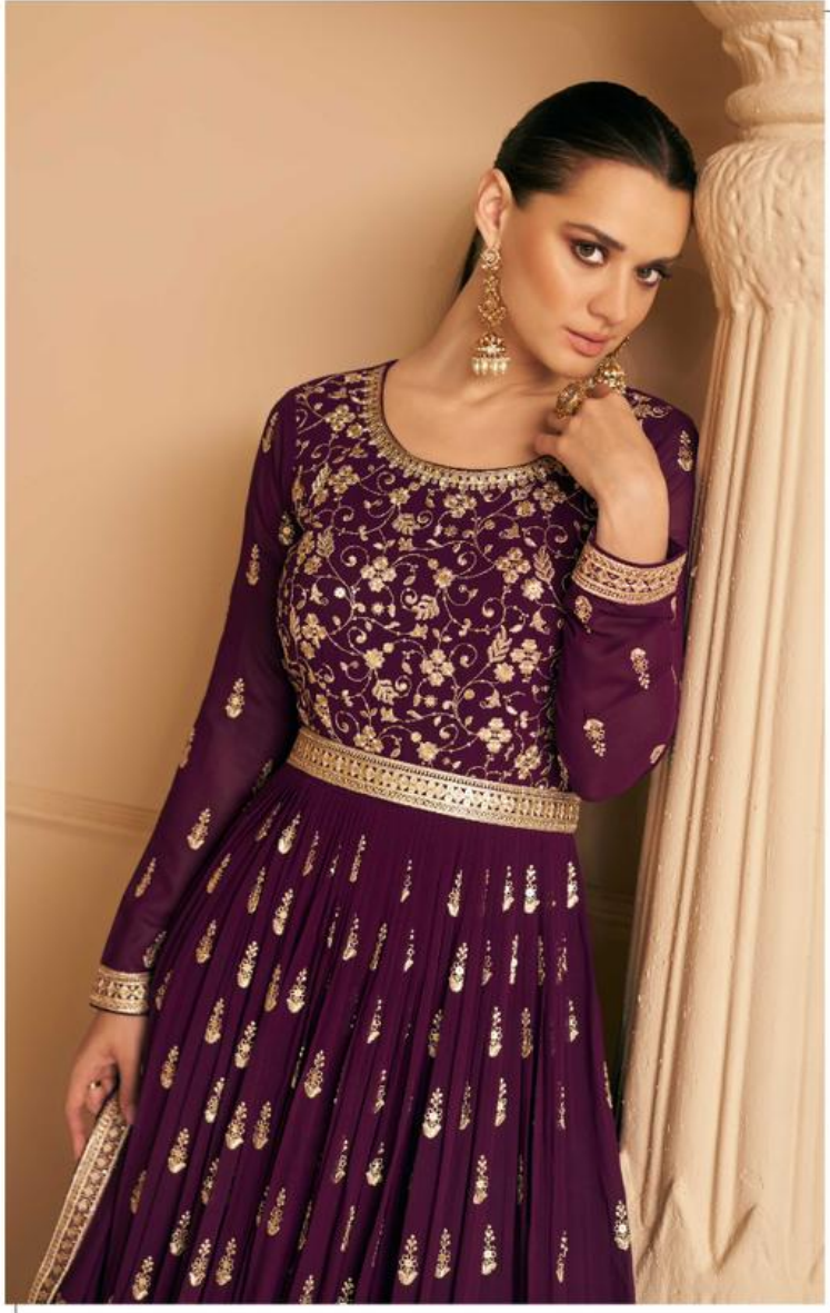
A | - 9655