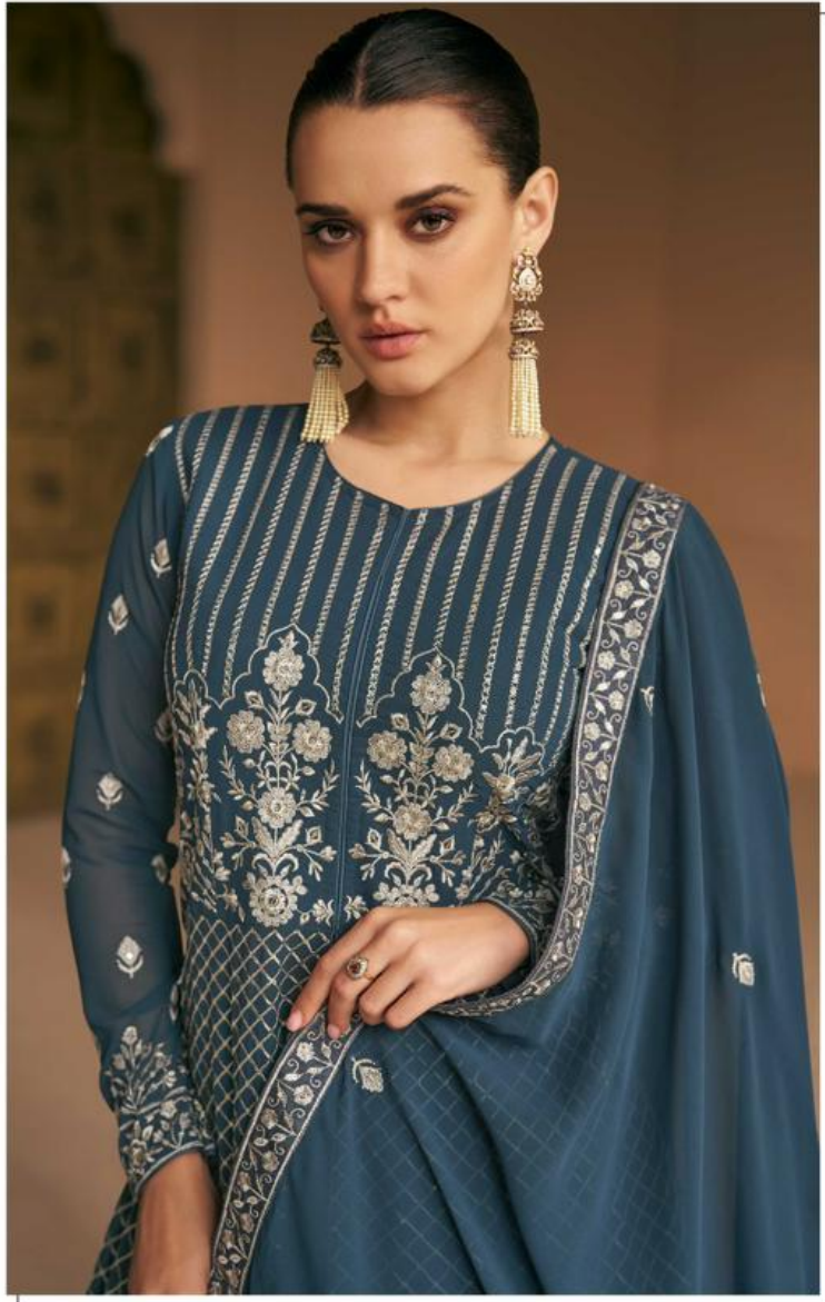
A | - 9656