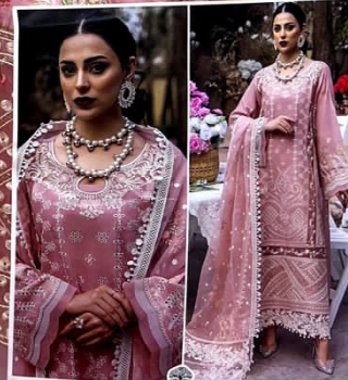
ALAYNA W.C. 2 ZAHA D.No. 10194 TOP: Cotton Cotton With Heavy Embroidery BOTTOM-INNER: Semi-Linen DUPATTA: Butterfly Net With Heavy Embroidery