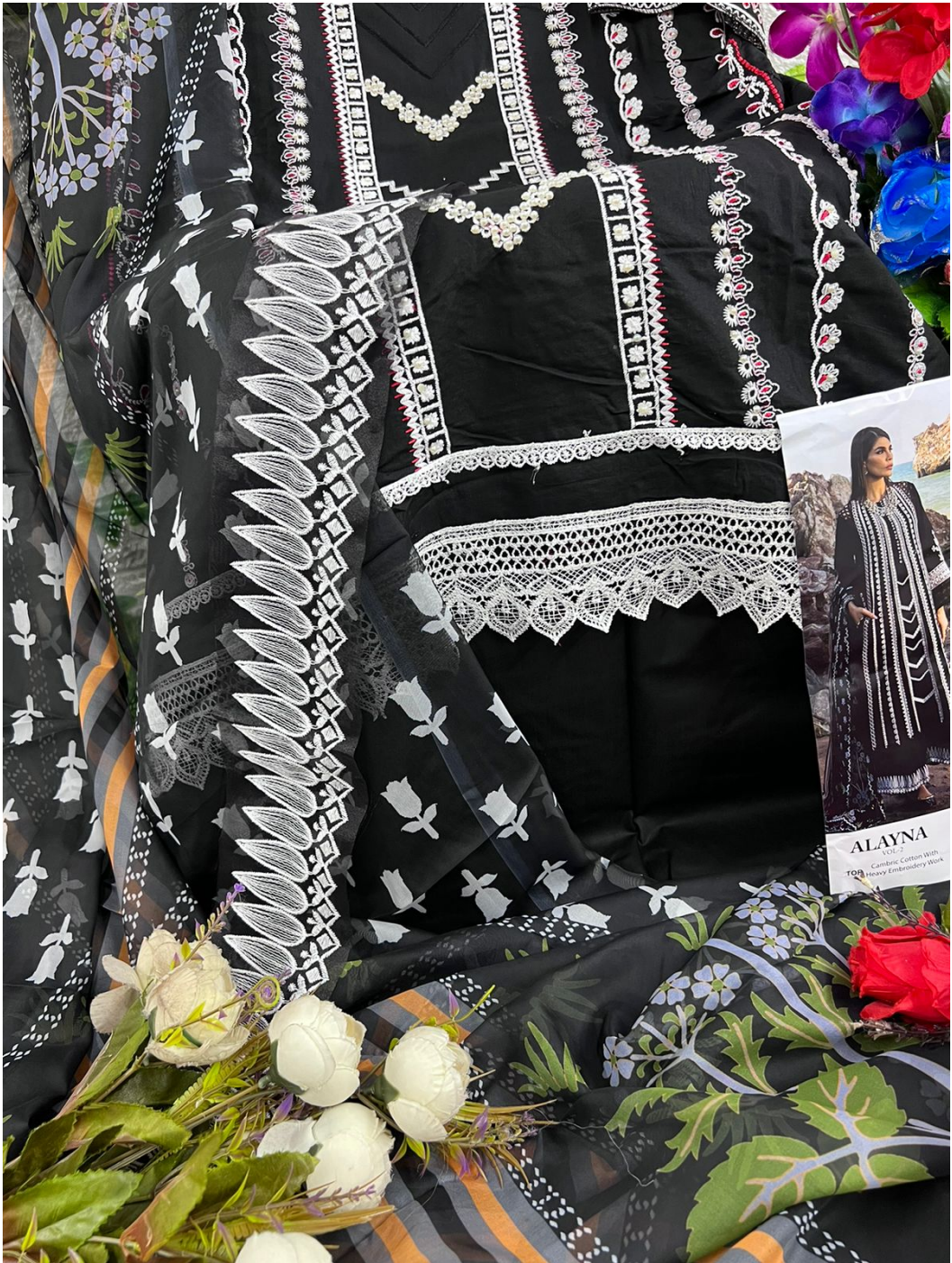
ALAYNA VOL. 2 TOP - Candide Cotton With Heavy Embroidery Work