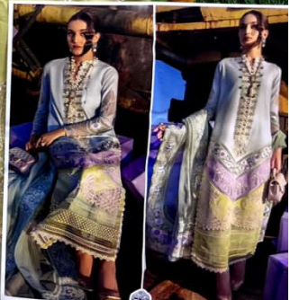
ALAYNA ZAHA D.No. 10192 TOP Embroid Cotton With Heavy Embroidery Work BOTTOM INNER Same Fabric DUPATTA Butterfly Net With Heavy Embroidery