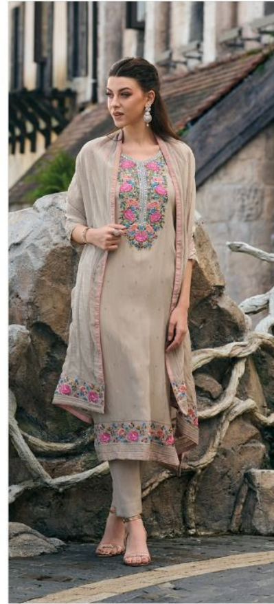
1203 | URFI