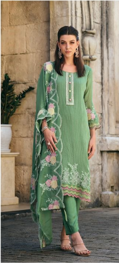
1201 | URFI