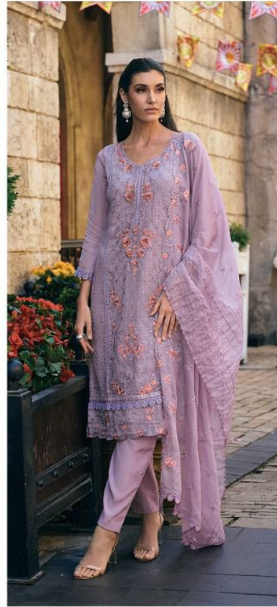
1202 | URFI