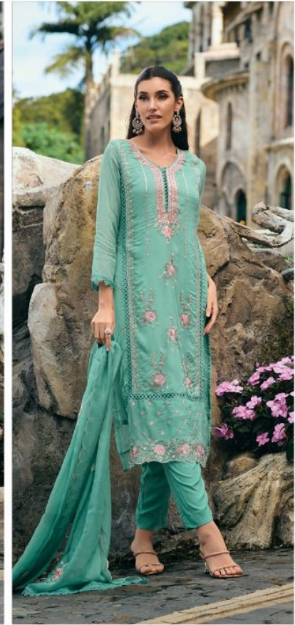
1204 | URFI