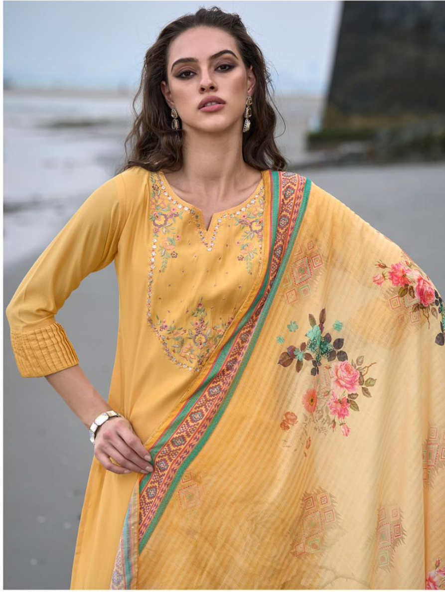
A GIRL SHOULD BE TWO THINGS CLASSY AND FABULOUS