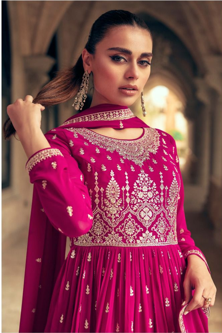
A | -9648