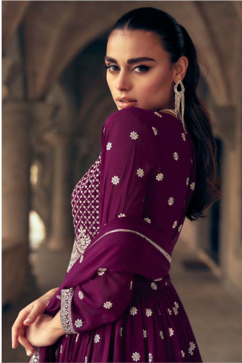
A | -9645