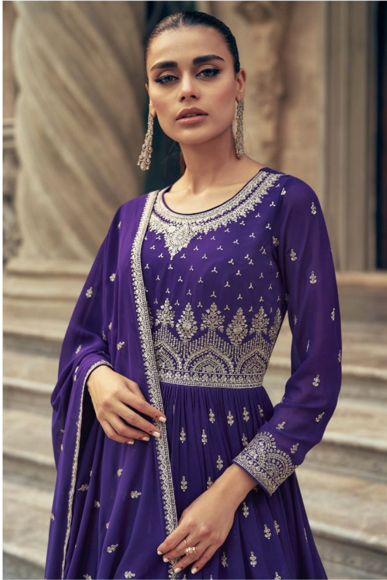
A | -9646