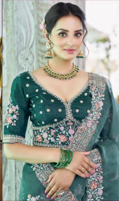
D.No.10007 Fabric Organza Silk