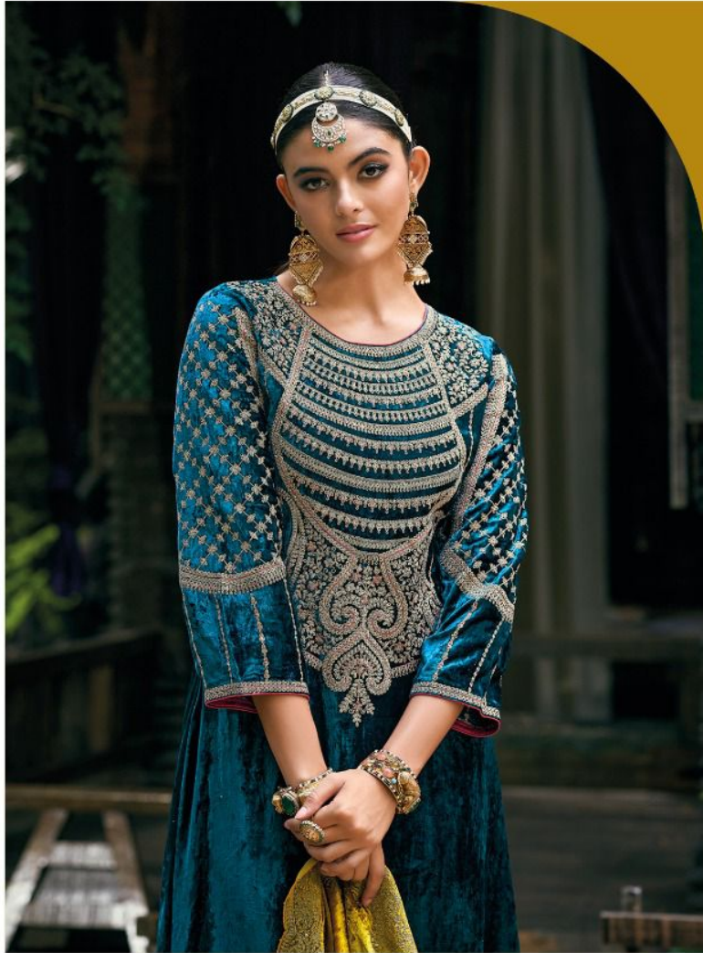
THE BEST WAY TO MAKE A DREAM COME TRUE IS TO WAKE UP