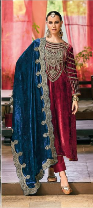
D - 512