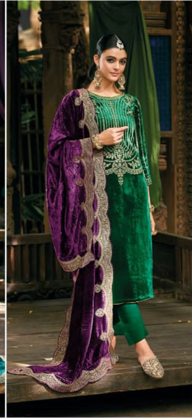
D - 514