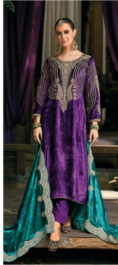
D - 513