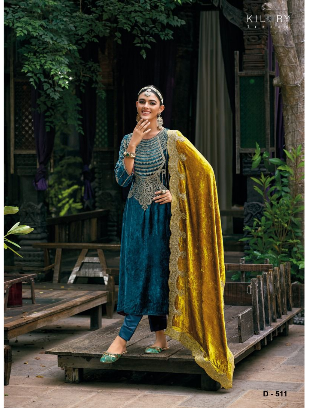
D - 511