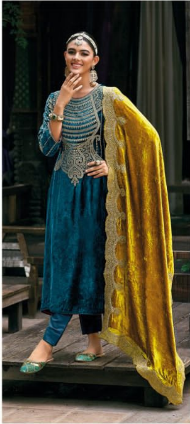
D - 511