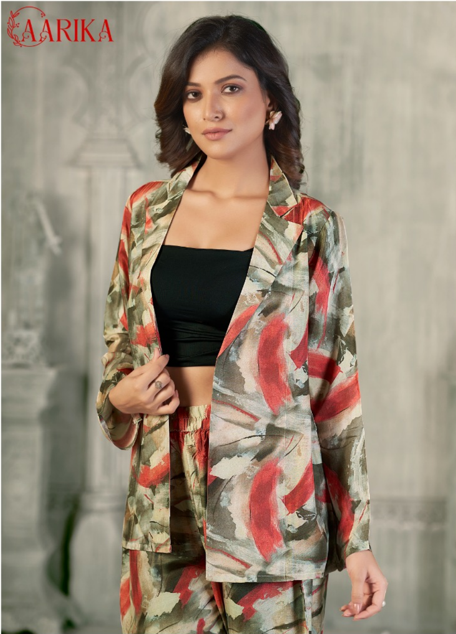
D.No:4913 Fashion you can buy, but style you possess. The key to style is learning who you are, which takes years. There's no how-to road map to style. It's about self-expression and, above all, attitude.