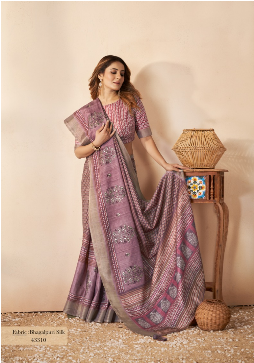
Fabric :Bhagalpuri Silk 43310