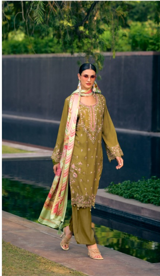
A GIRL SHOULD BE TWO THINGS CLASSY AND FABULOUS