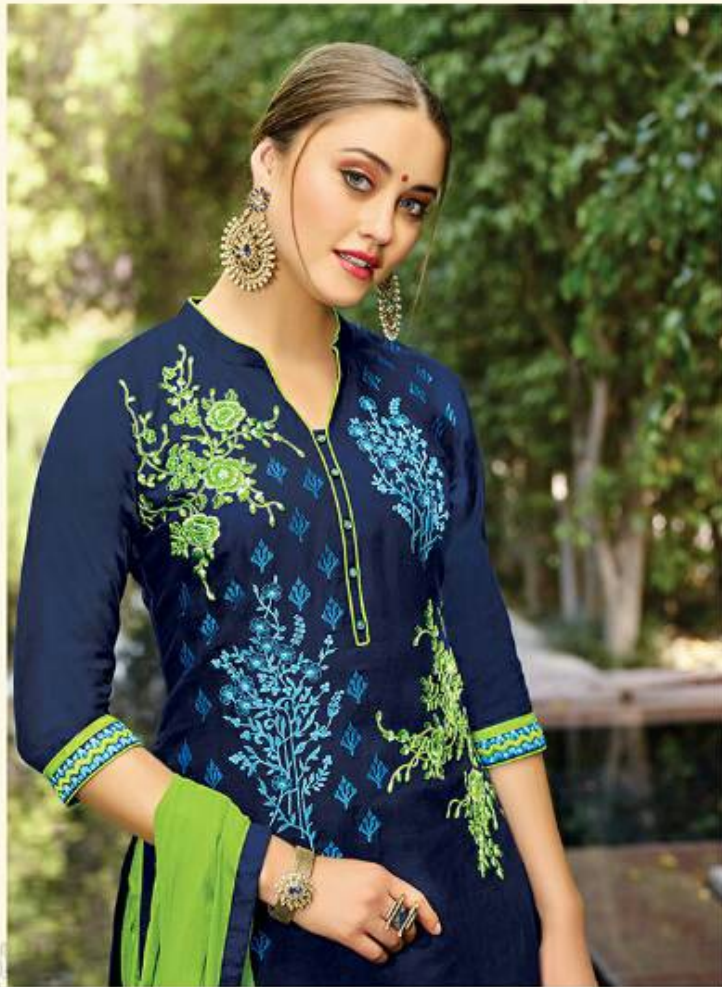
Show a distinct emotion in this beautifully designed blue and green dress