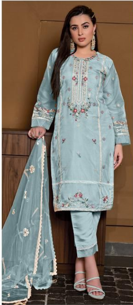
SR - 3016