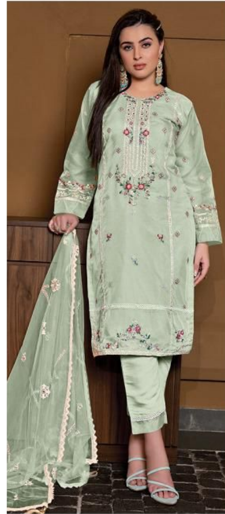
SR - 3016 C