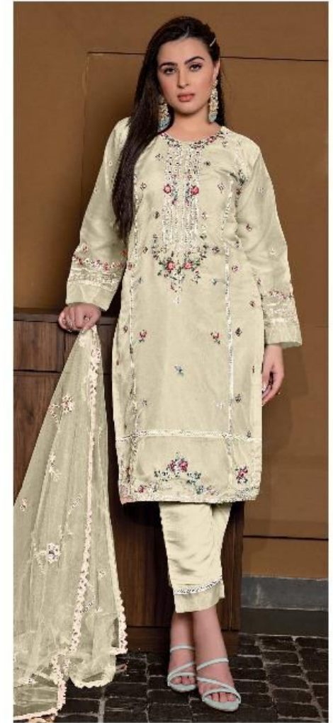
SR - 3016 D