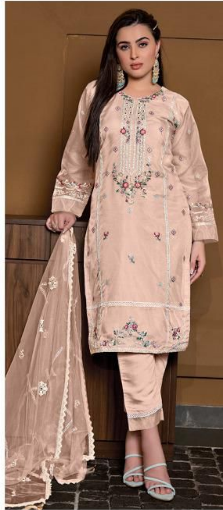
SR - 3016 B