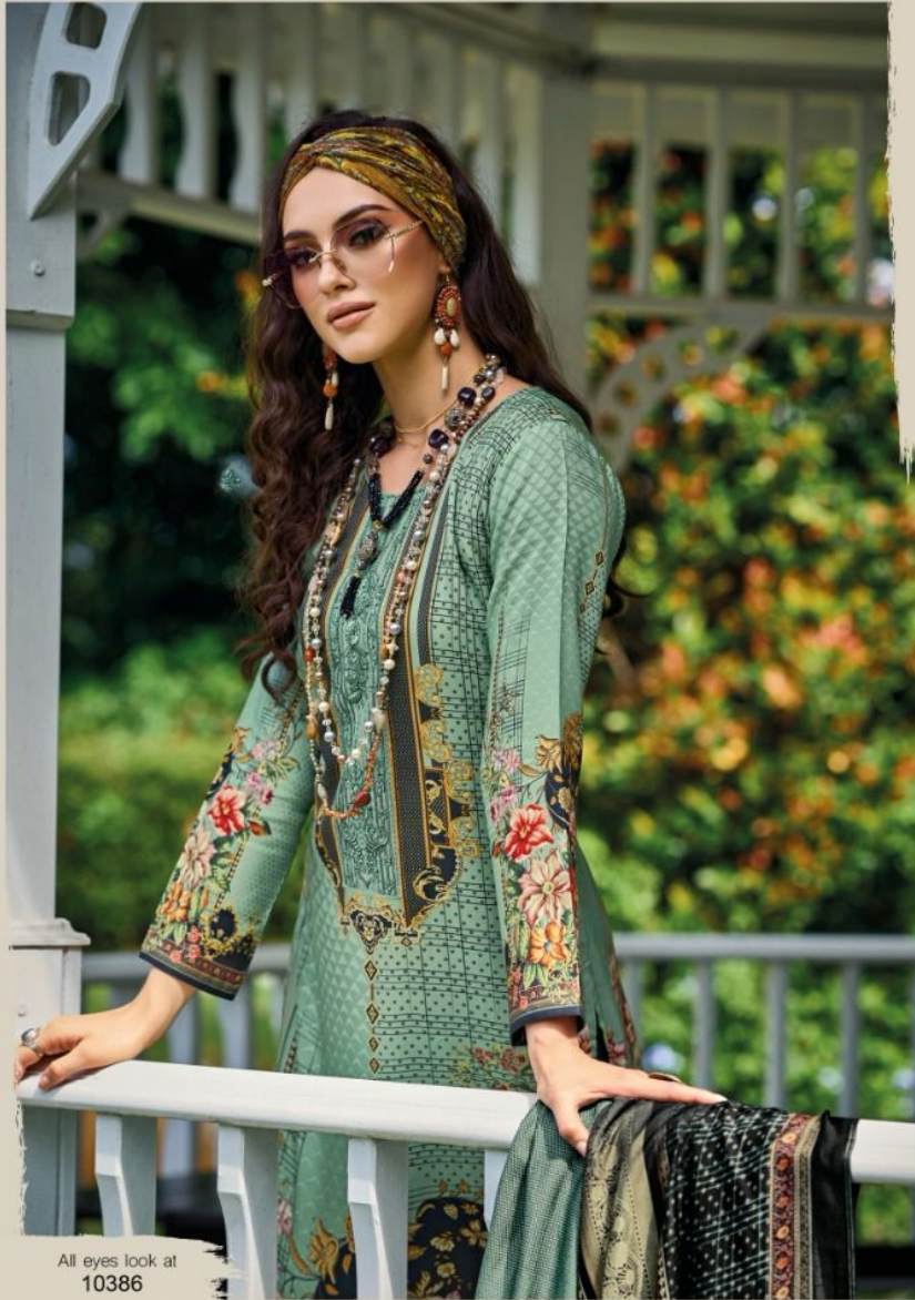
All eyes look at 10386