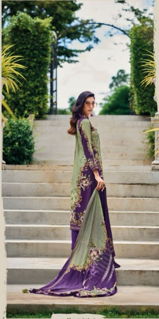
All eyes look at 10384