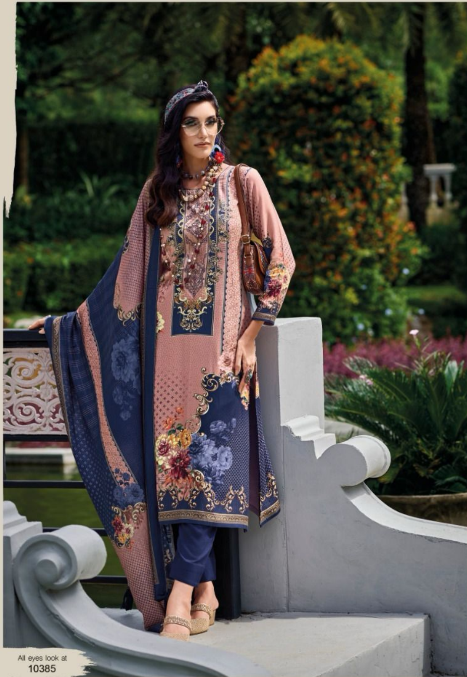
All eyes look at 10385