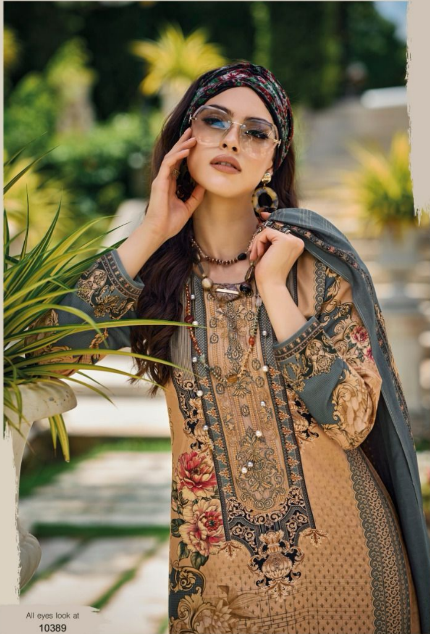
All eyes look at 10389