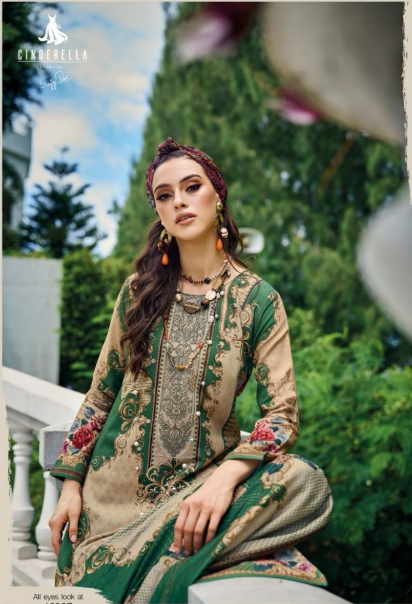
All eyes look at 10387