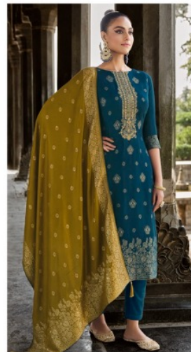
830-001 ■ ■ ■