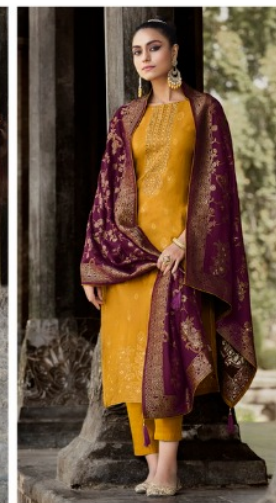
830-006 ■ ■ ■