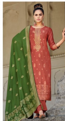
830-005 ■ ■ ■