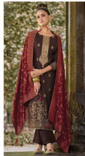
830-002 ■ ■ ■