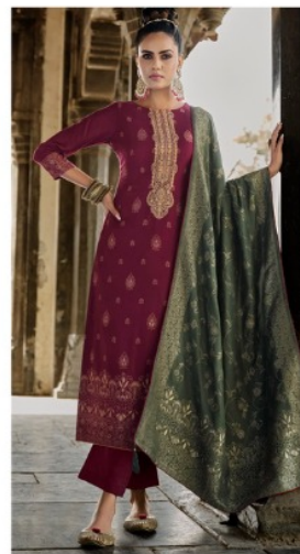
830-004 ■ ■ ■