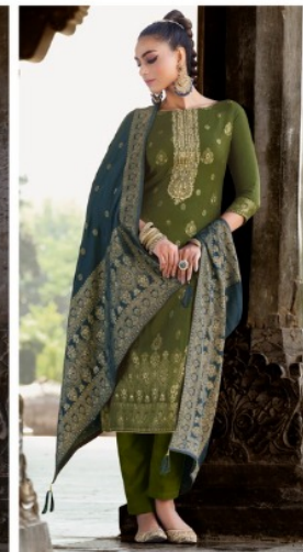
830-003 ■ ■ ■