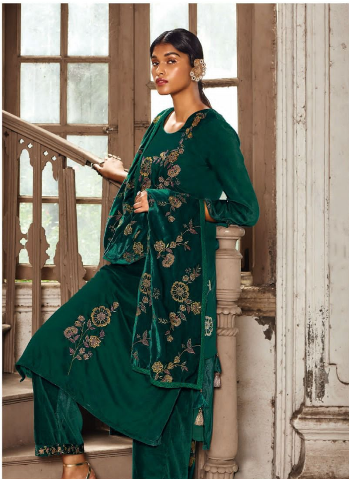
Ganga Fashions presents Sarmaa When you are in wait for someone special,standing in your balcony with a flower in hand makes you the best in this world. from top to down your combination with this lehnga is a beautiful day for someone.