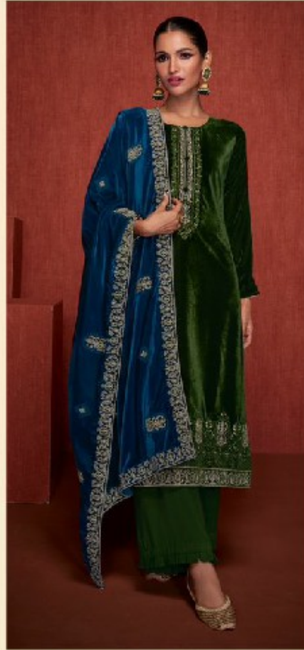
Najakat -E- Leeba -1002