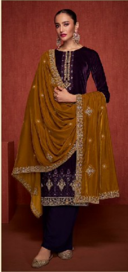
Najakat -E- Leeba -1001

ممتاز آرٹس Mumtaz Arts Purveyors of Elegance