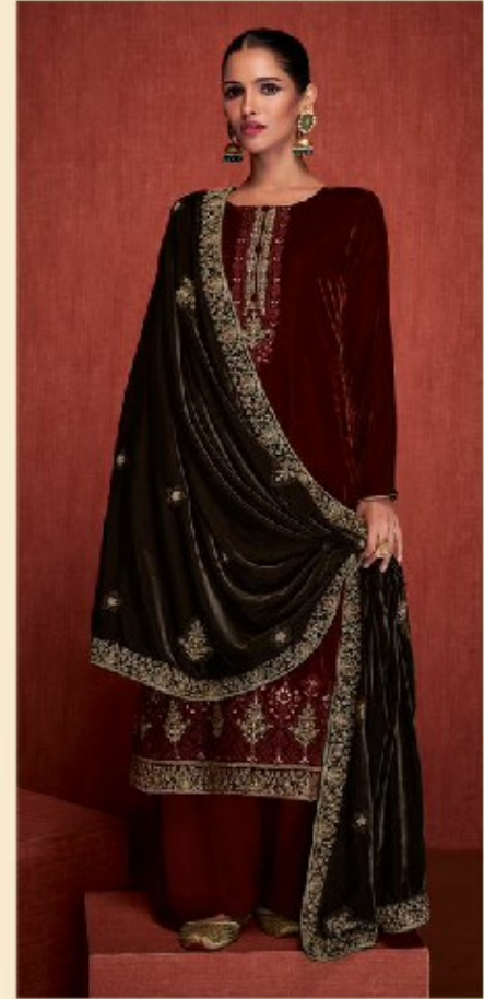
Najakat -E- Leeba -1004