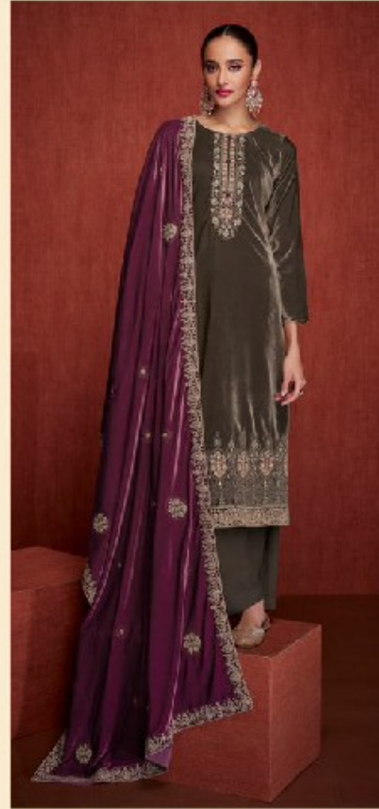
Najakat -E- Leeba -1003