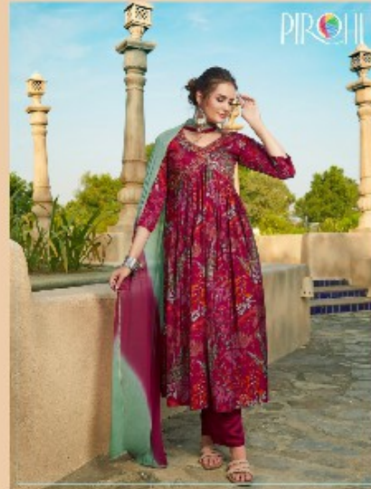
D.No - 1002