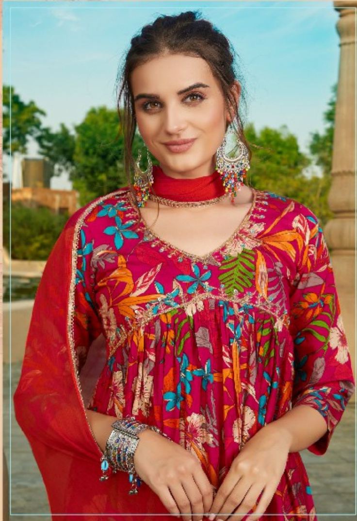
Traditional fashion doesn't mean to look after the trends. But to keep the flames of our culture alive.