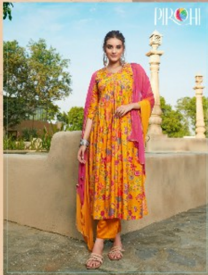
D.No - 1003