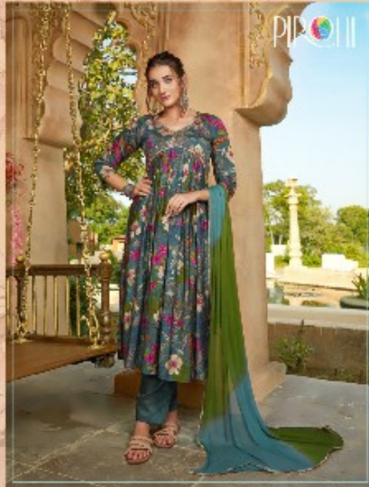
D.No - 1001