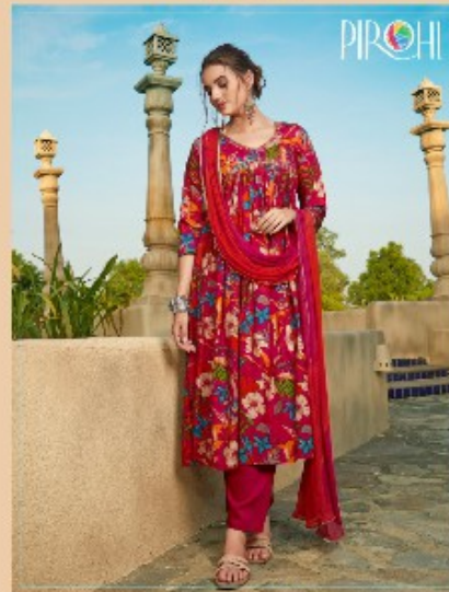
D.No - 1004