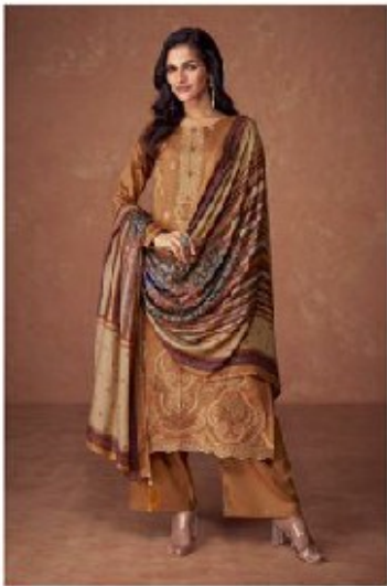
TABRIZ - 81003