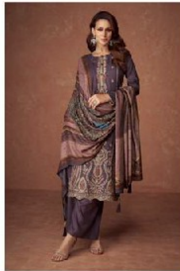
TABRIZ - 81004

منقار آرٹس Munqar Arts Painting the legacy THE TABRIZ COLLECTION