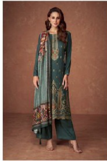
TABRIZ - 81002