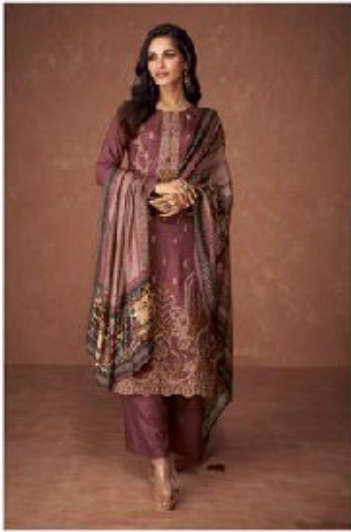
TABRIZ - 81001