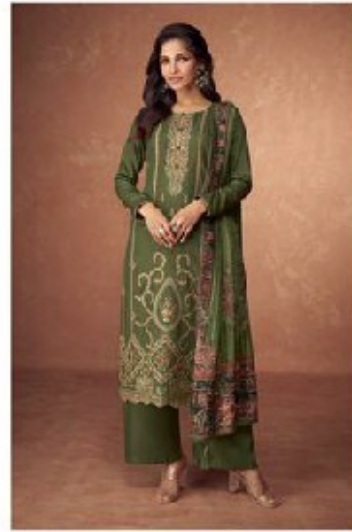
TABRIZ - 81005