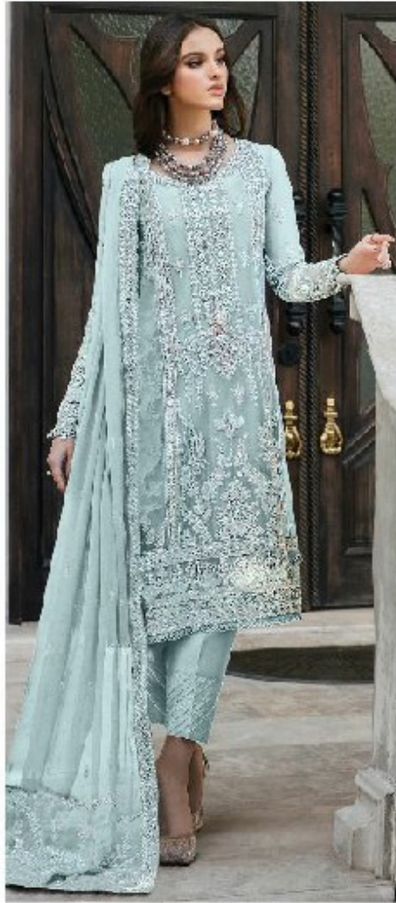
D - 5424 A