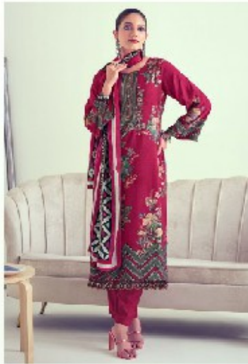
LOOK | 1503