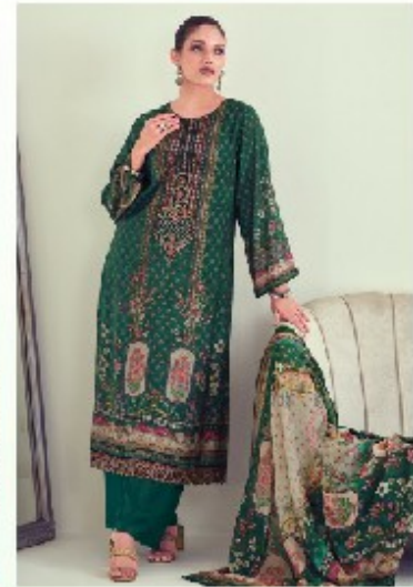
LOOK | 1508