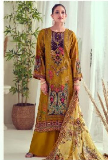
LOOK | 1507