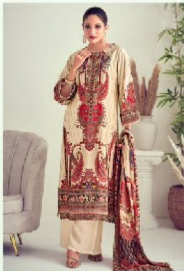
LOOK | 1505