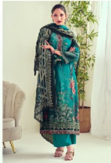
LOOK | 1504