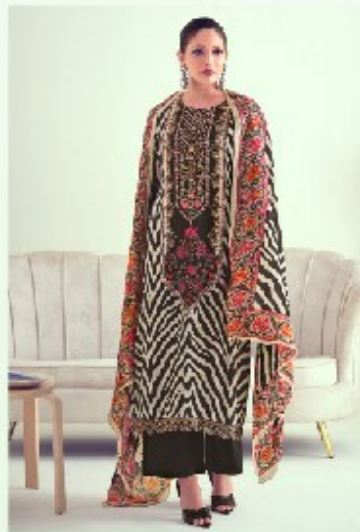
LOOK | 1506