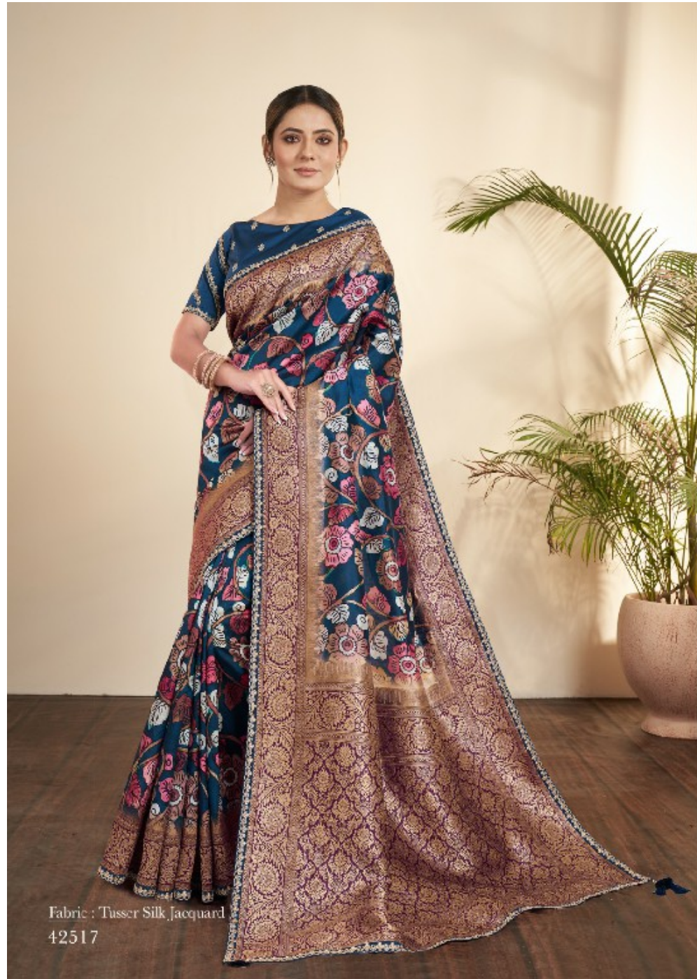
Fabric : Tussar Silk Jacquard 42517