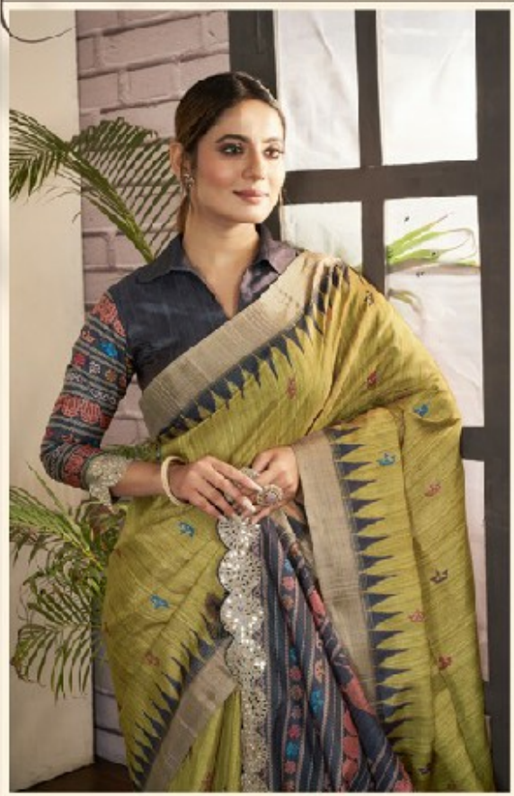
A beautiful saree with traditional looks in a harmonious blend of brown and cream. A classic design, that exudes your captivating beauty