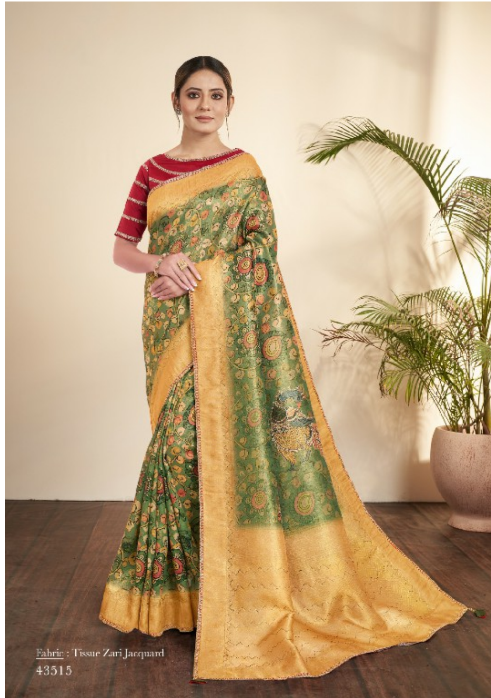
Fabric : Tissue Zari Jacquard 43515