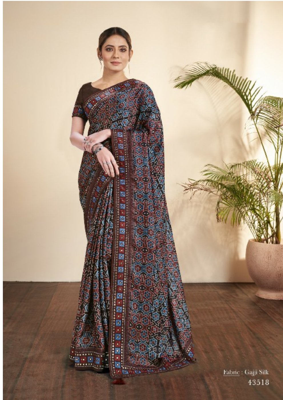
Fabric : Gajji Silk 43518