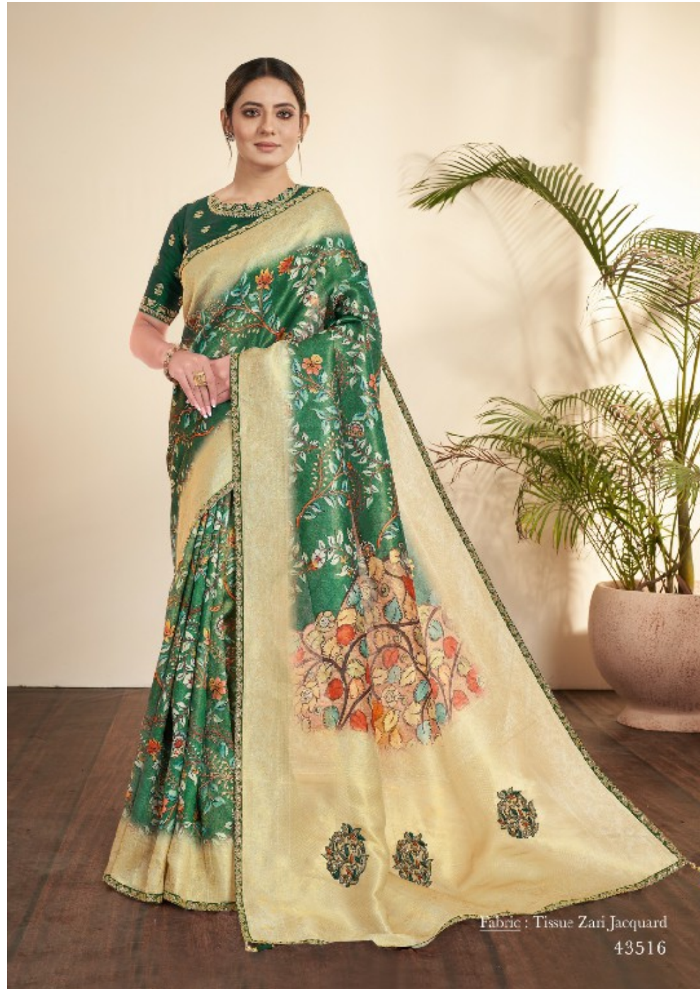
Fabric : Tissue Zari Jacquard 43516