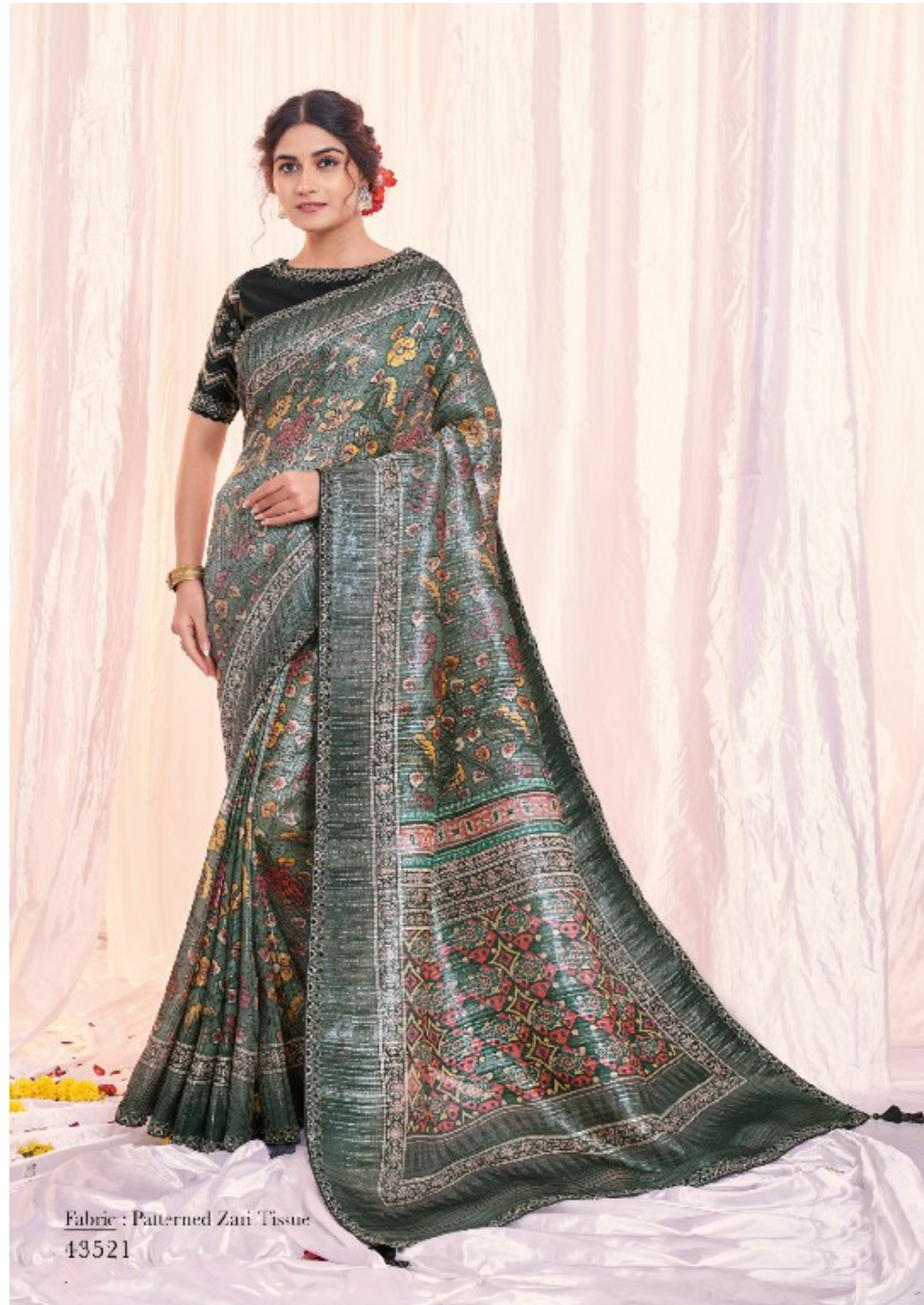
Fabric : Patterned Zari Tissue 43521