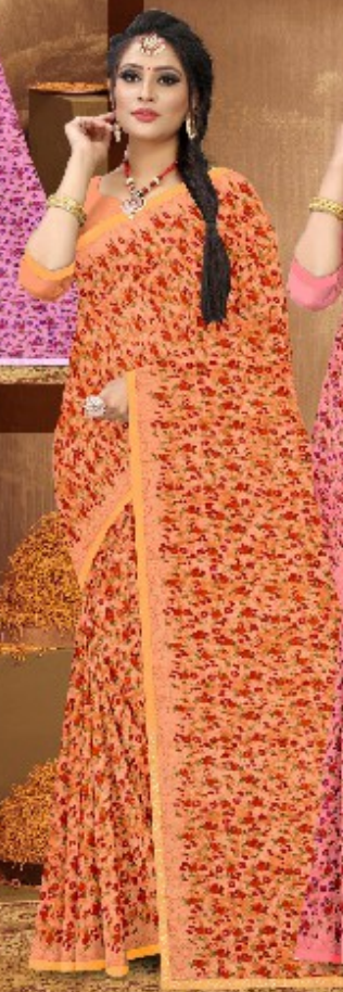
Design - 3005