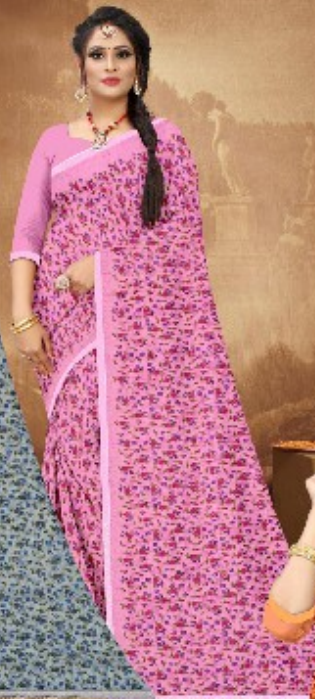
Design - 3004