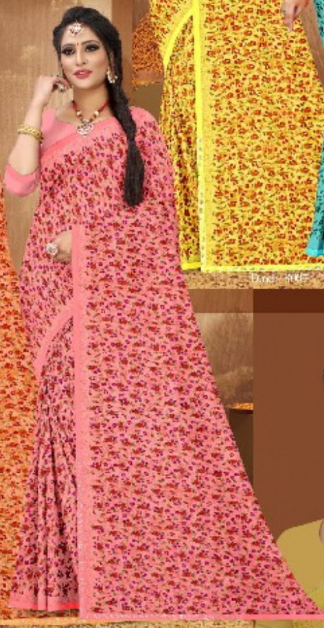
Design - 3006