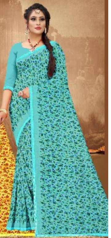
Design - 3008