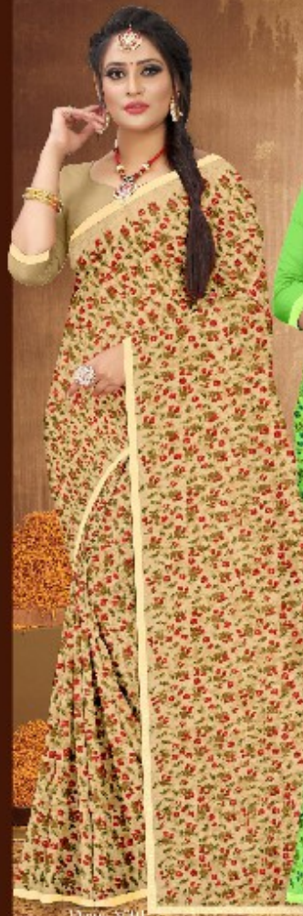
Design - 3001

A perfect fit for a woman who has to wear it, what she wears is her which reflects her intensity