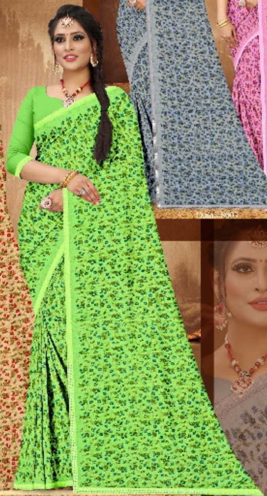
Design - 3002