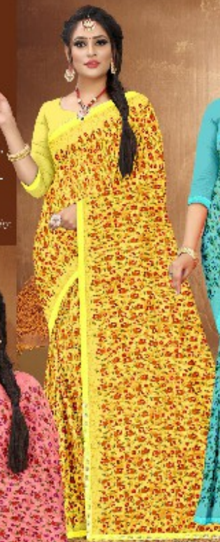
Design - 3007