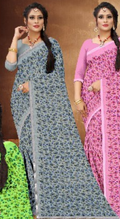
Design - 3003