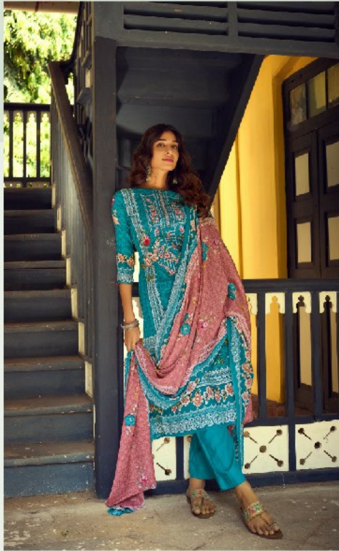
Simplicity a current trend that you sport with a personal taste