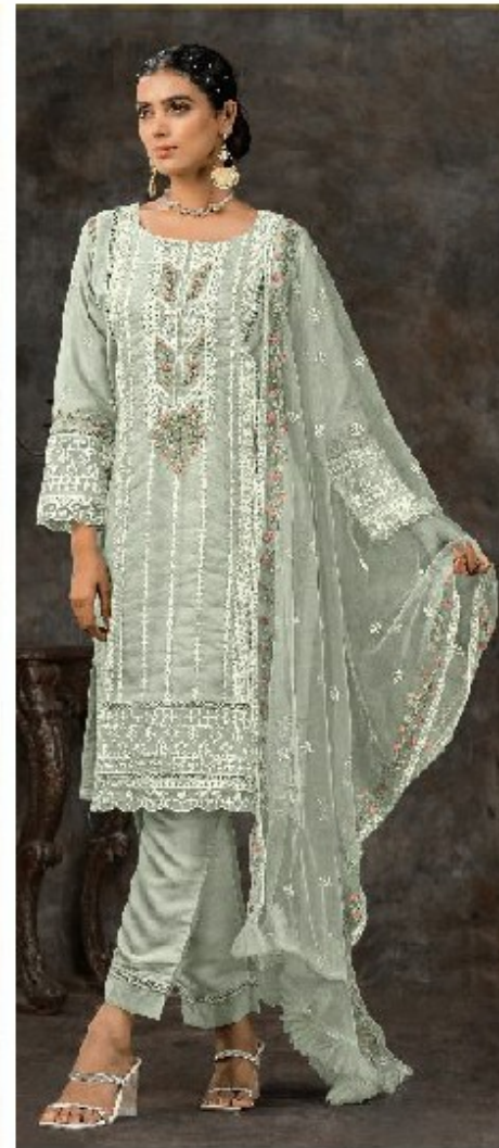
C - 1680 C