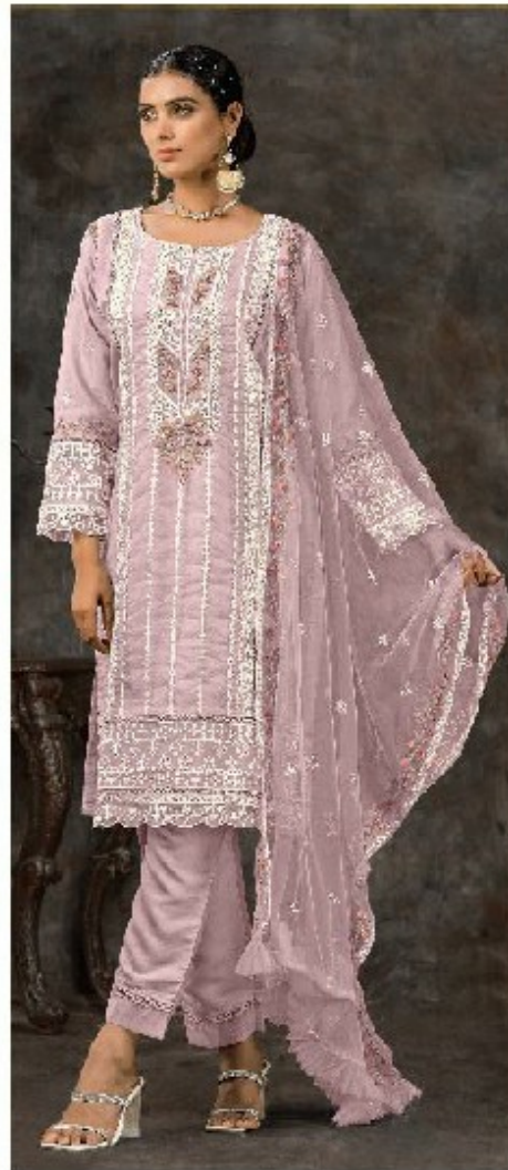
C - 1680 B