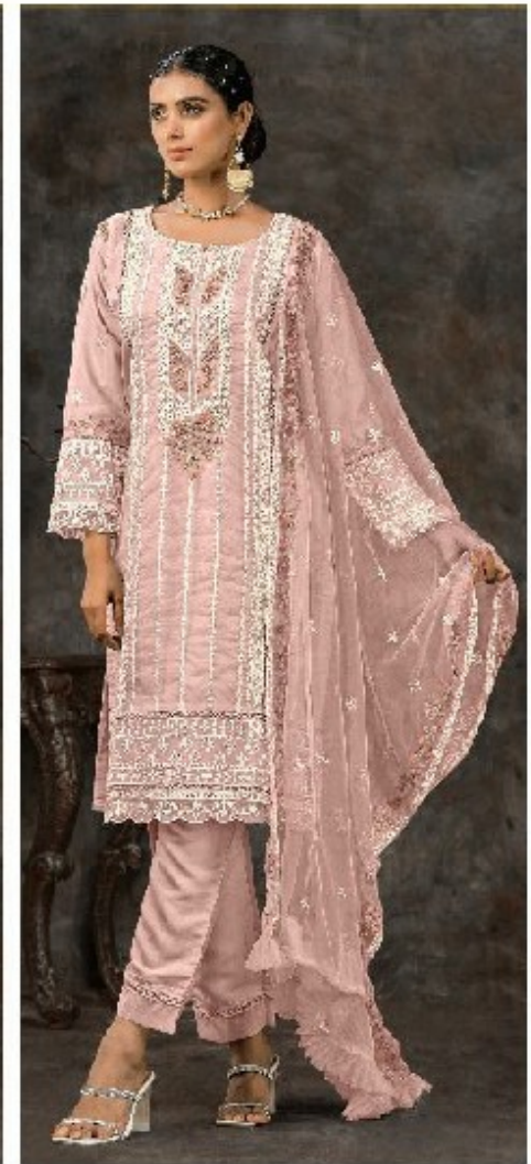
C - 1680 D