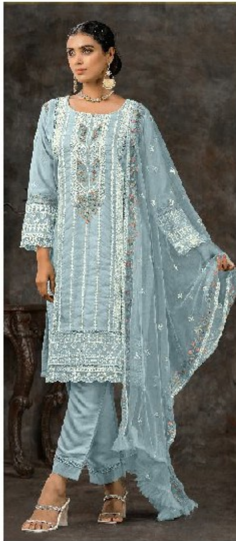
C - 1680