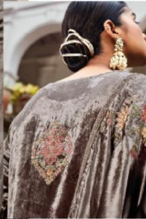
Ganga Fashions presents Munal Ethnic wear that can be donned on any auspicious festival, making your look graceful. Timeless designs, sewn with intricacy, celebrating the glory of celebrities.