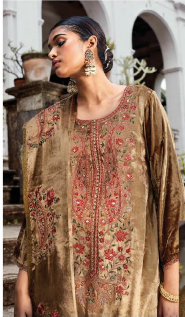
Ganga Fashions presents Munal Ethnic wear that can be donned on any auspicious festival, making your look graceful. Timeless designs, sewn with intricacy, celebrating the glory of celebrations.