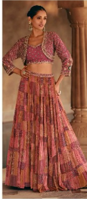
CODE - 5392