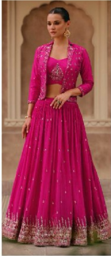
CODE - 5391