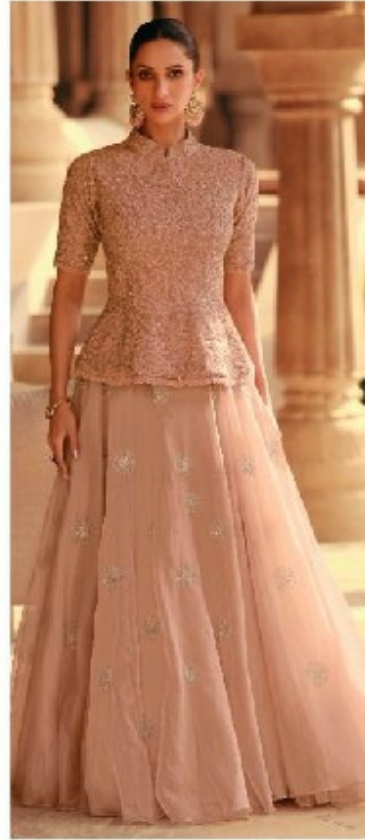
CODE - 5393