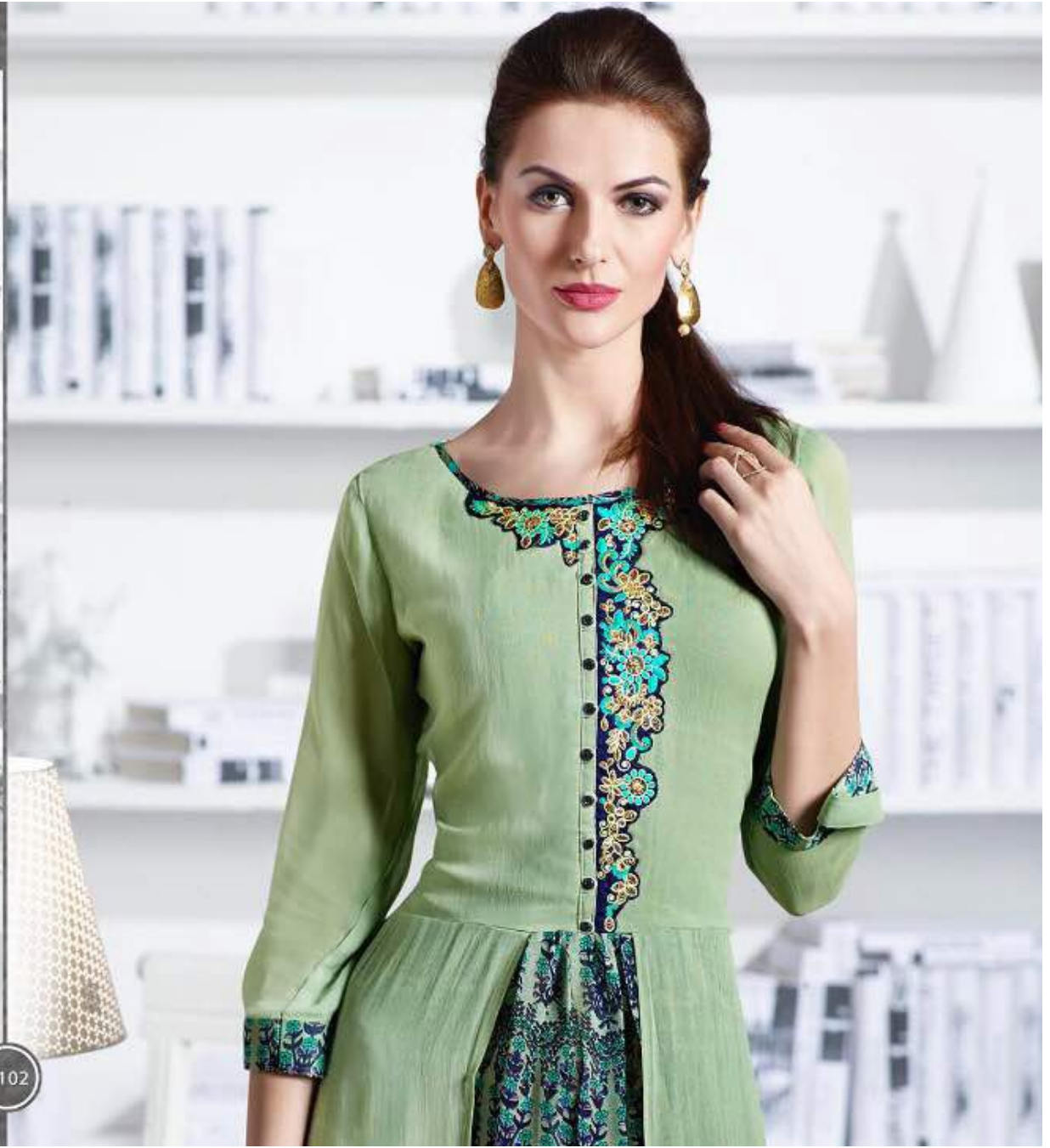
A masterful designed shift, spring flower pattern kurti with sophisticated sleeve design, season is all about celebrating and bringing out the best in you.