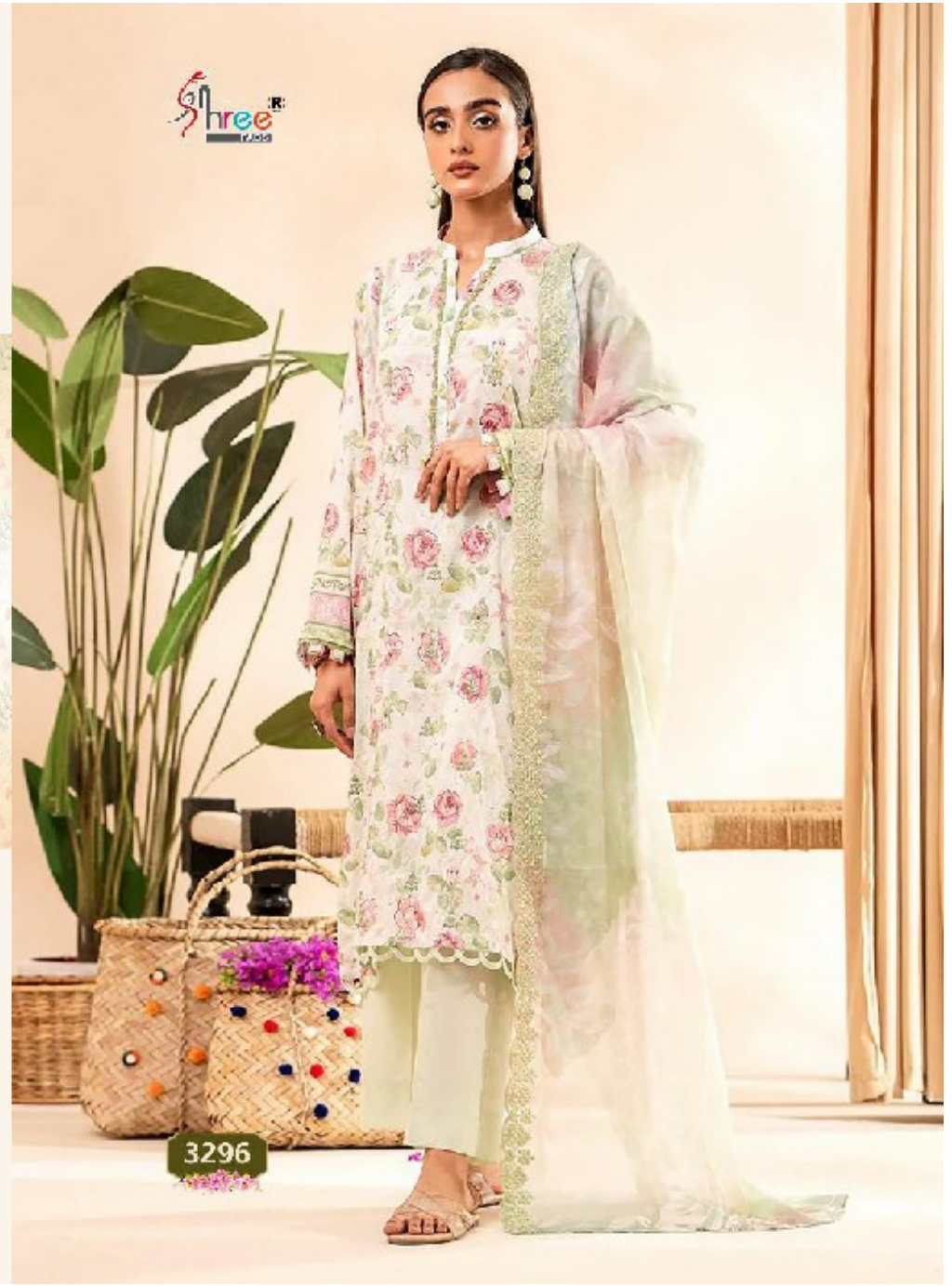
❁ SANA SAFINAZ ❁ CHIKANKARI COLLECTION VOL-2