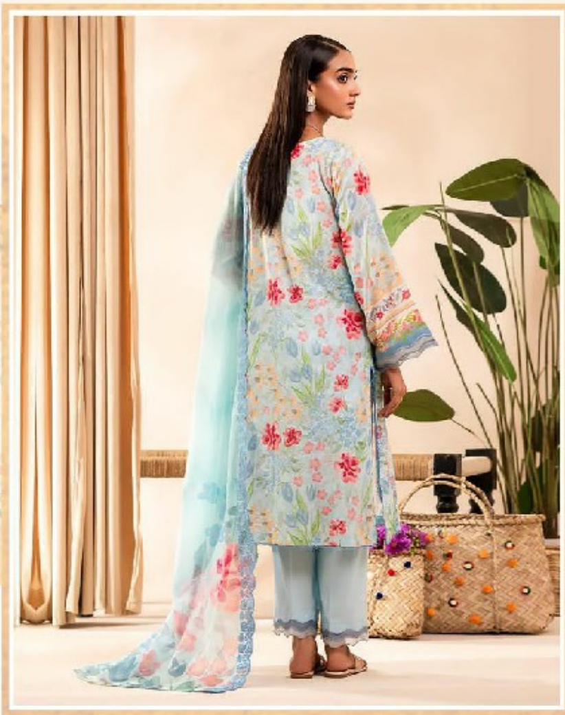
❁ SANA SAFINAZ ❁ CHIKANKARI COLLECTION VOL-2