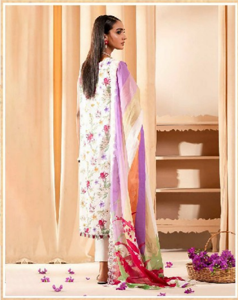
❁ SANA SAFINAZ ❁ CHIKANKARI COLLECTION VOL-2