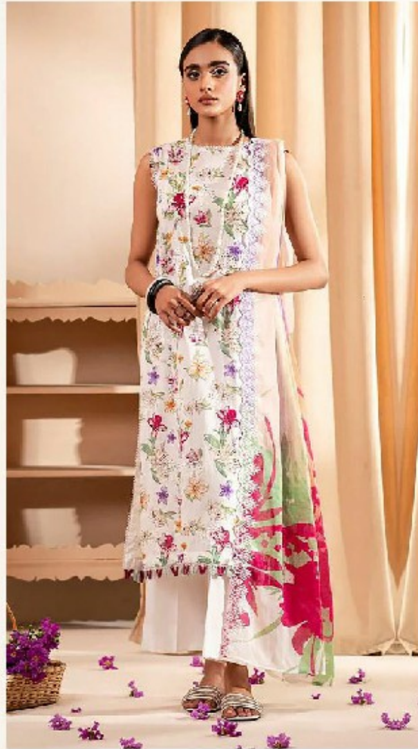
❖ SANA SAFINAZ ❖ CHIKANKARI COLLECTION VOL-2