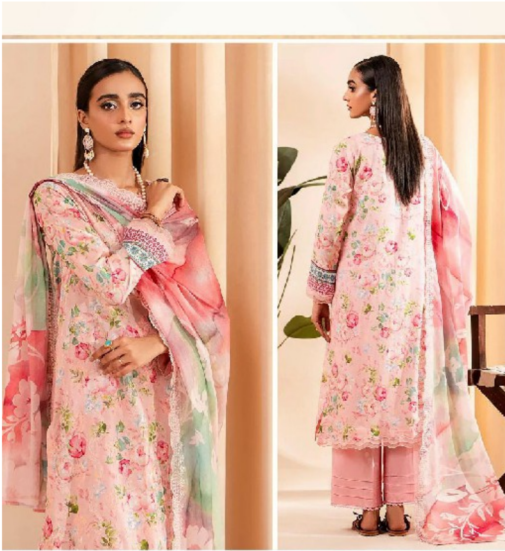
❁ SANA SAFINAZ ❁ CHIKANKARI COLLECTION VOL-2

The logo for 'Shree' is located in the top left corner of the right-hand image. It features the word 'Shree' in a stylized font with a registered trademark symbol (®) and the year '2008' below it.