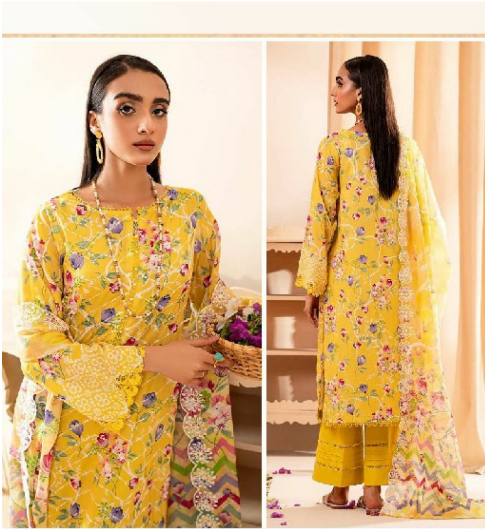
❁ SANA SAFINAZ ❁ CHIKANKARI COLLECTION VOL-2