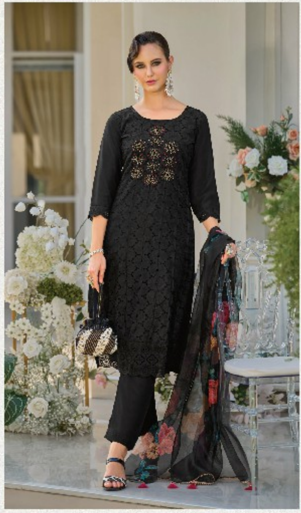
— WILLY & PIERRE / SINOVA / LILY & LALI / THE BOUTIQUE —