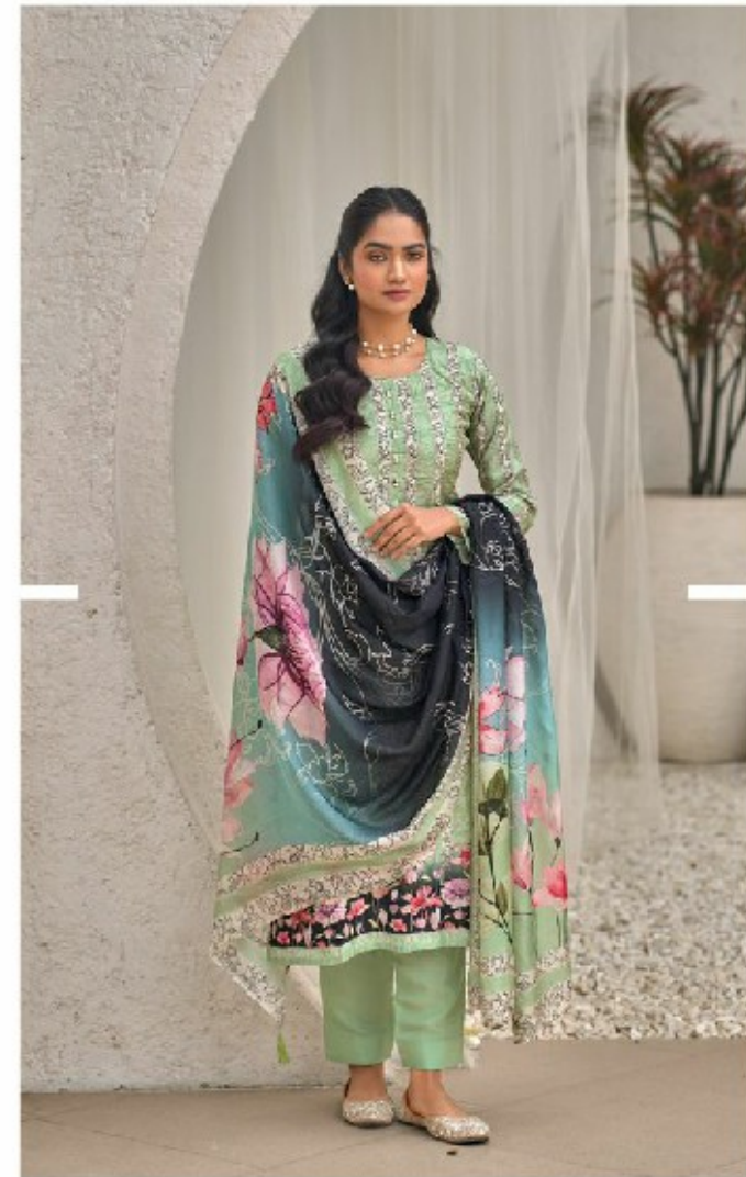
10496 KEEP CALM & SURROUND YOURSELF WITH FASHION