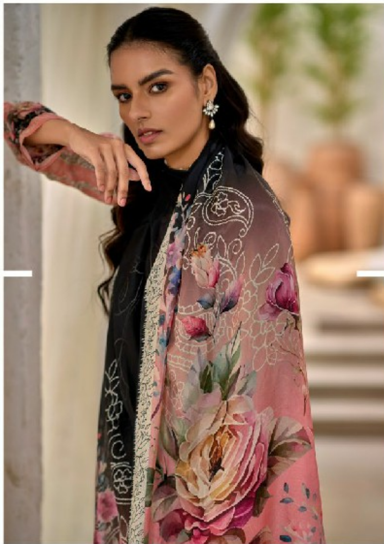
OUTFITS THAT WILL MAKE YOU COMFORTABLY BEAUTIFUL