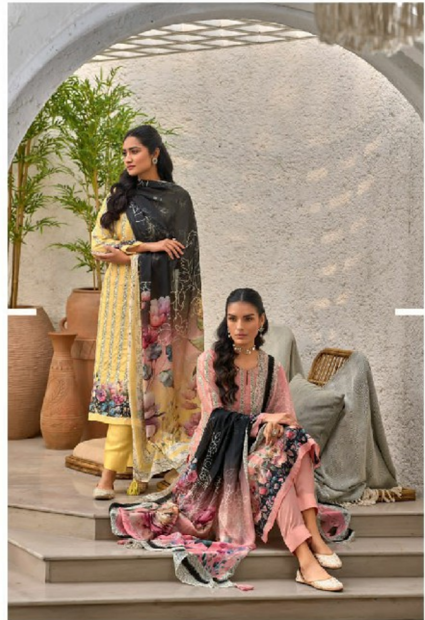
OUTFITS THAT WILL MAKE YOU COMFORTABLY BEAUTIFUL