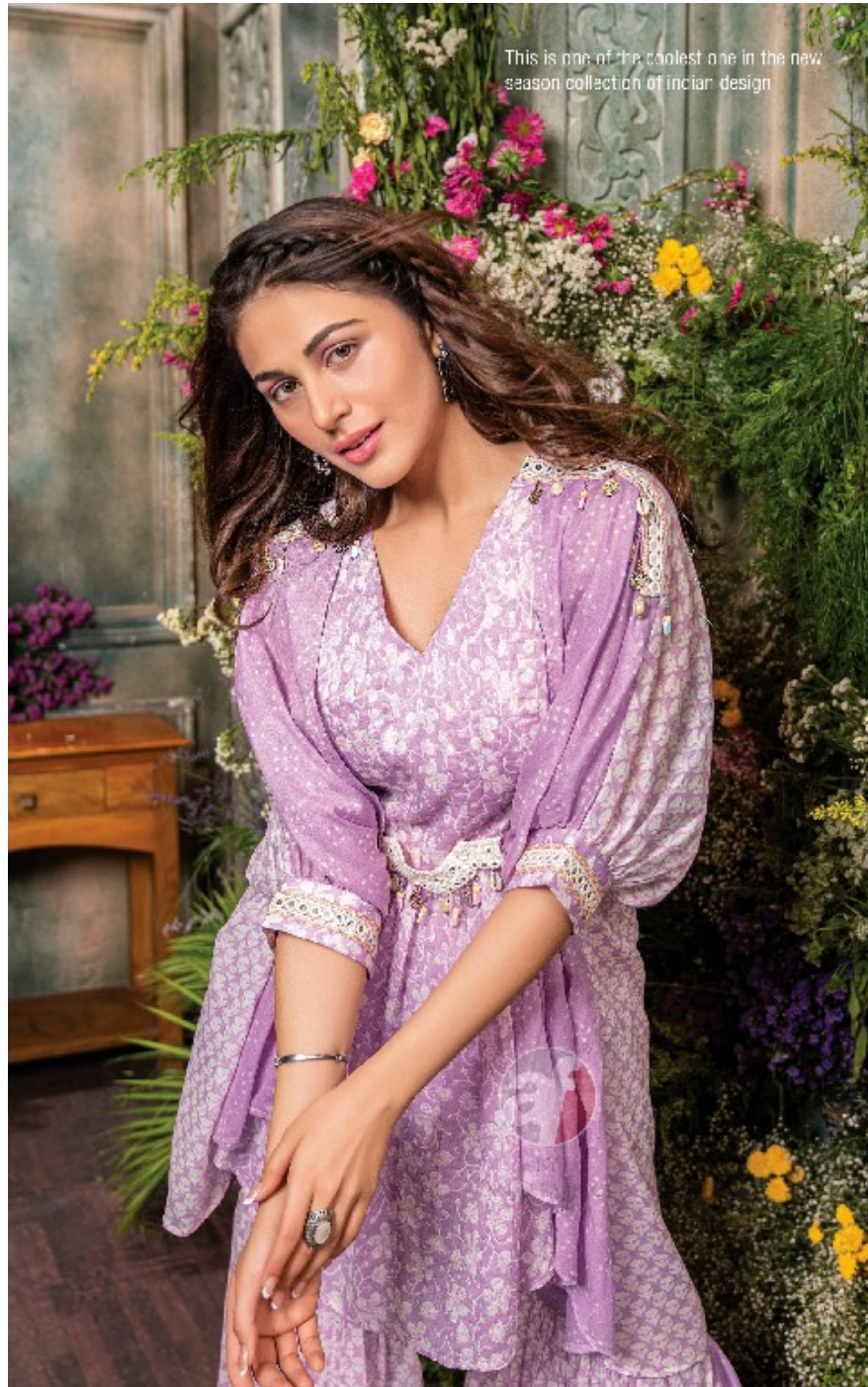
This is one of the coolest one in the new season collection of inciar design