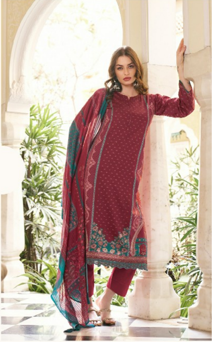
This festive season step on with the newest trends; adorn their dresses with eternal grace!