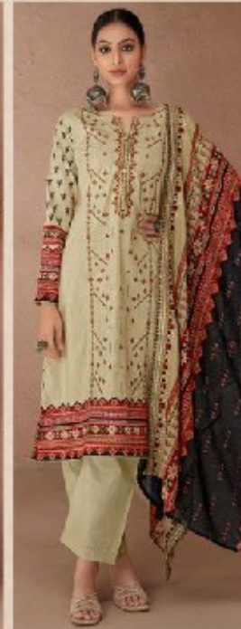
— 29005 —