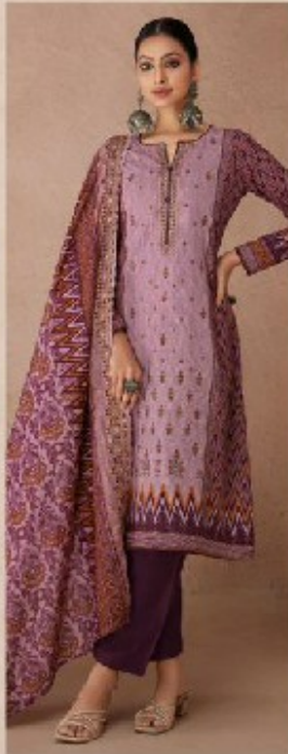
— 29002 —