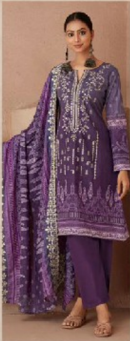
— 29001 —