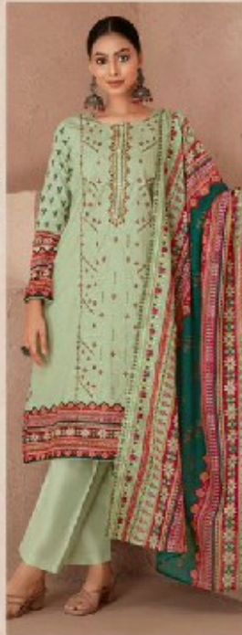
— 29003 —