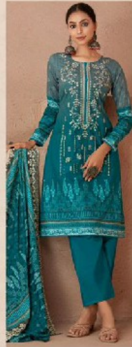
— 29004 —