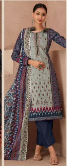
— 29006 —