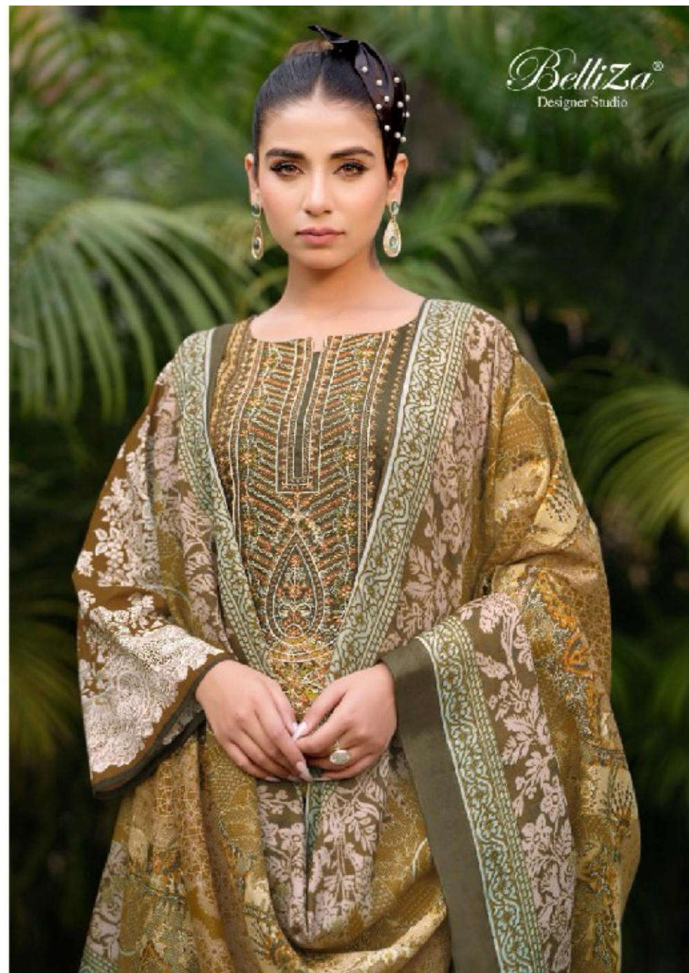
Belliza® Designer Studio