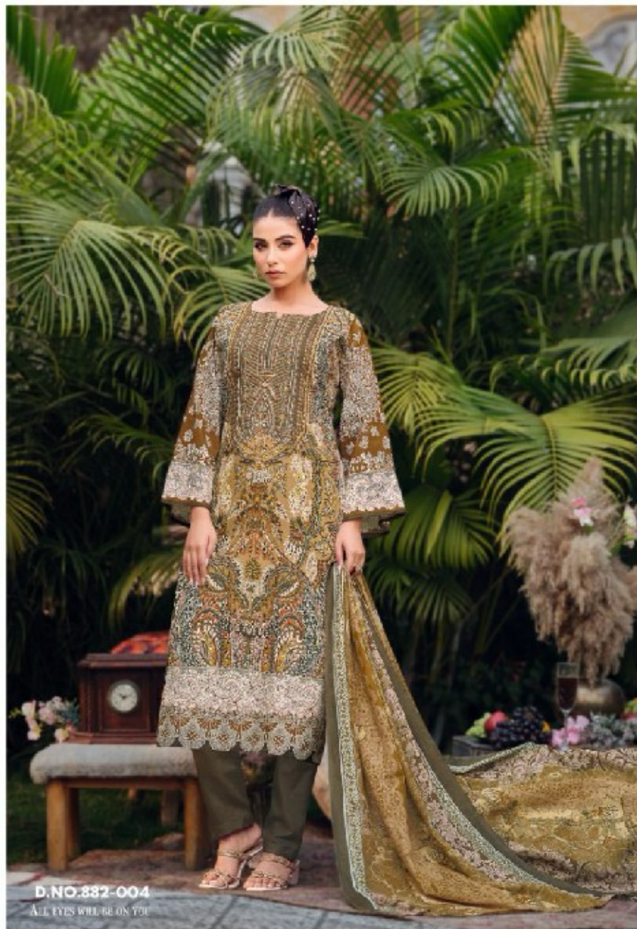
D.NO:882-004 ALL EYES WILL BE ON YOU