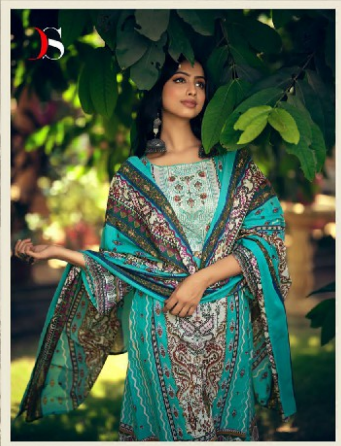
Contemporary geometric patterns