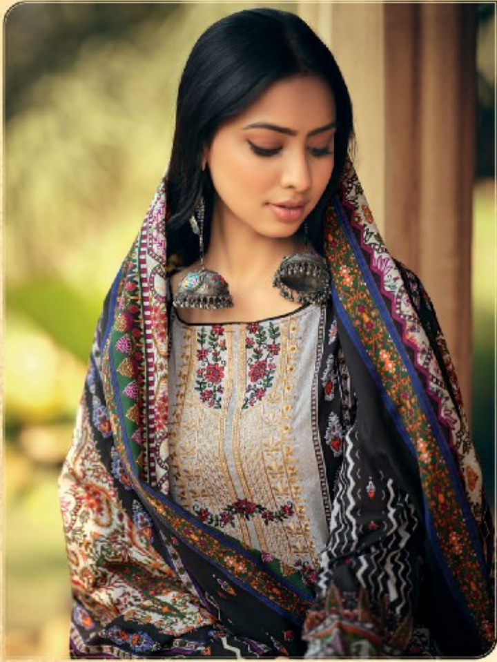
Casual summer sundress style