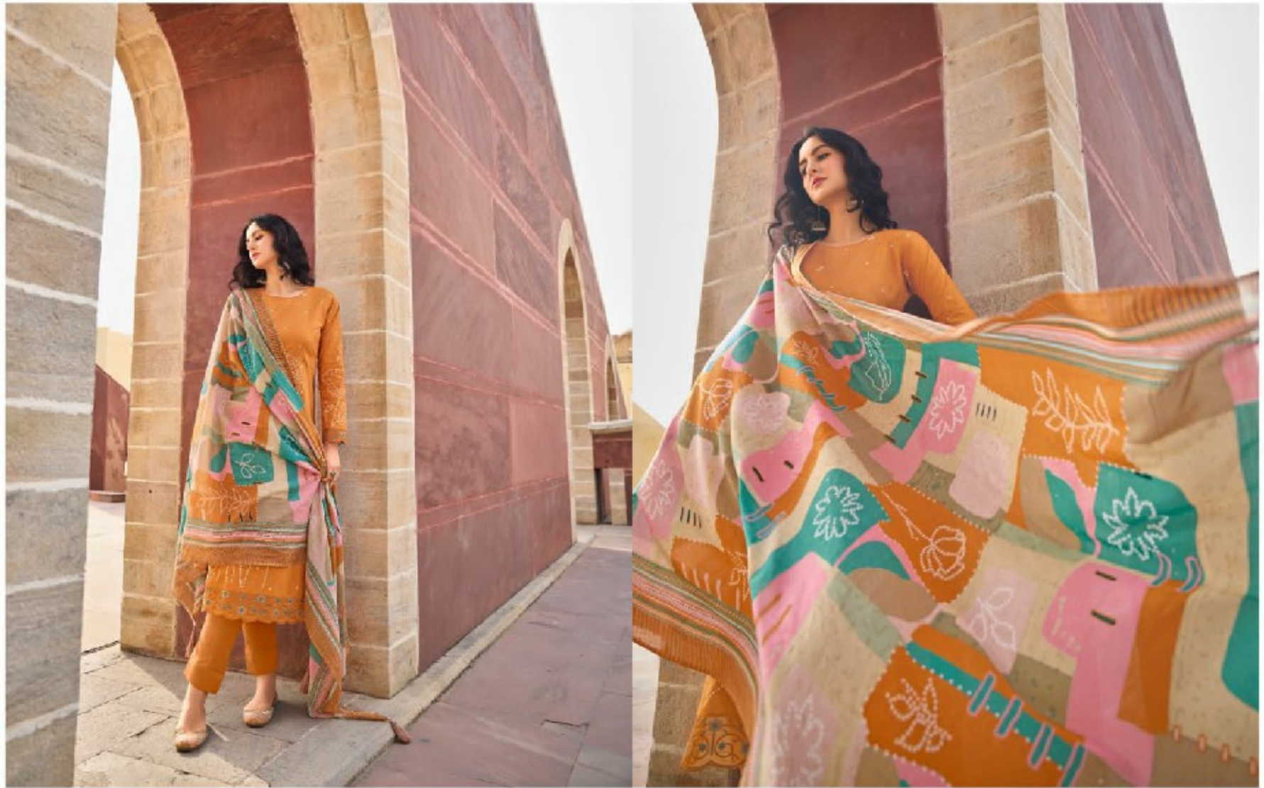
CLOTHES MEAN NOTHING UNTIL SOMEONE LIVES IN THEM