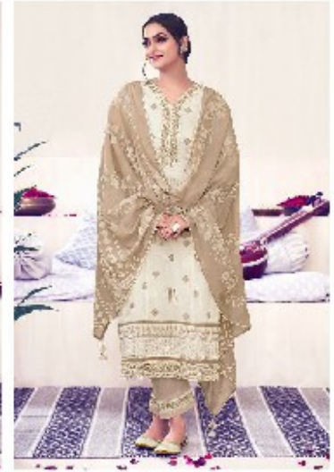
LOOK | 8986