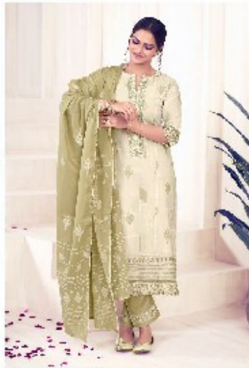
LOOK | 8984