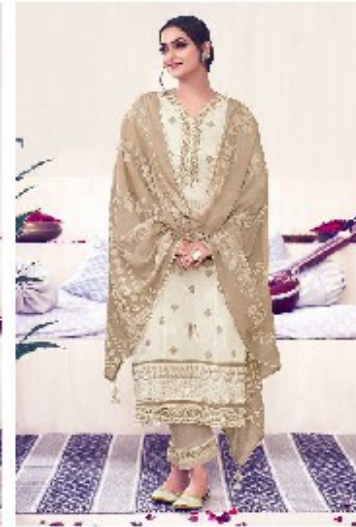
LOOK | 8986