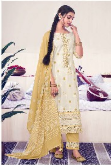
LOOK | 8981