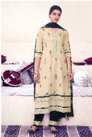
LOOK | 8983