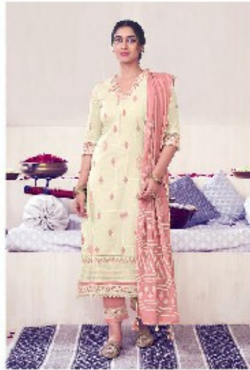
LOOK | 8982