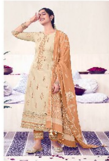
LOOK | 8985