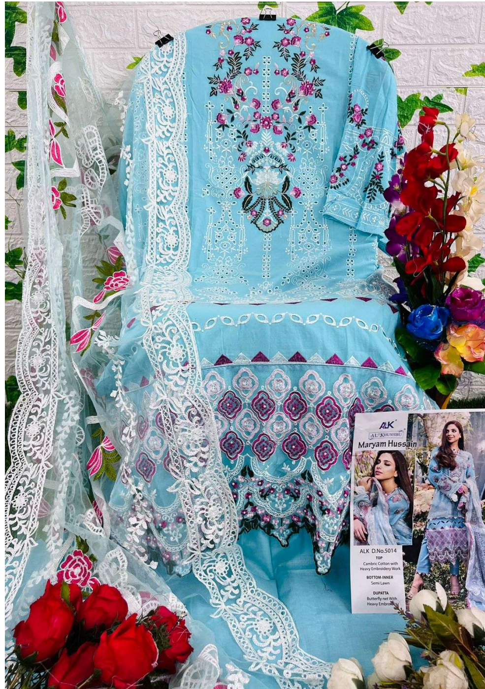
ALK AL KHUSHU Maryam Hussain ALK D.No.S014 TOP Cambic Cotton with Heavy Embroidery Work BOTTOM INNER Semi Lawn DUPATTA Butterfly net With Heavy Embroidery