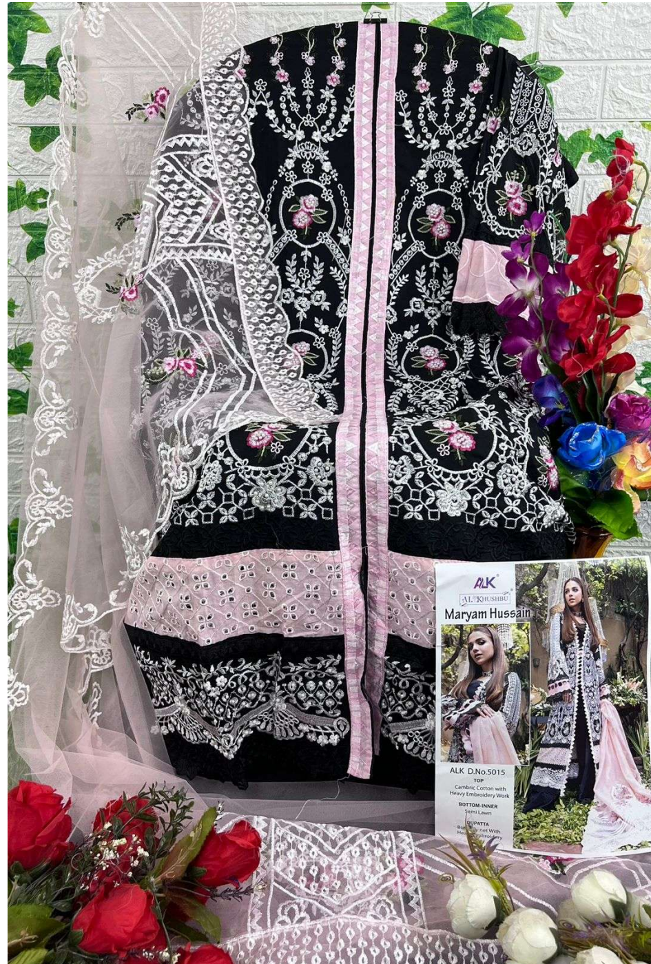
ALK AL KHUSHBU Maryam Hussain ALK D.No.5015 TOP: Cambric Cotton with Heavy Embroidery Work BOTTOM-INNER: Jersey Lائن SKIRTS: Back Panel With Heavy Embroidery