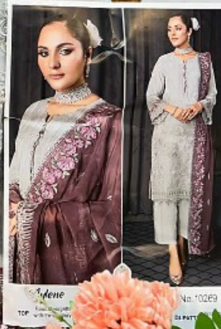
Lyene TOP No. 10269 DEPUT