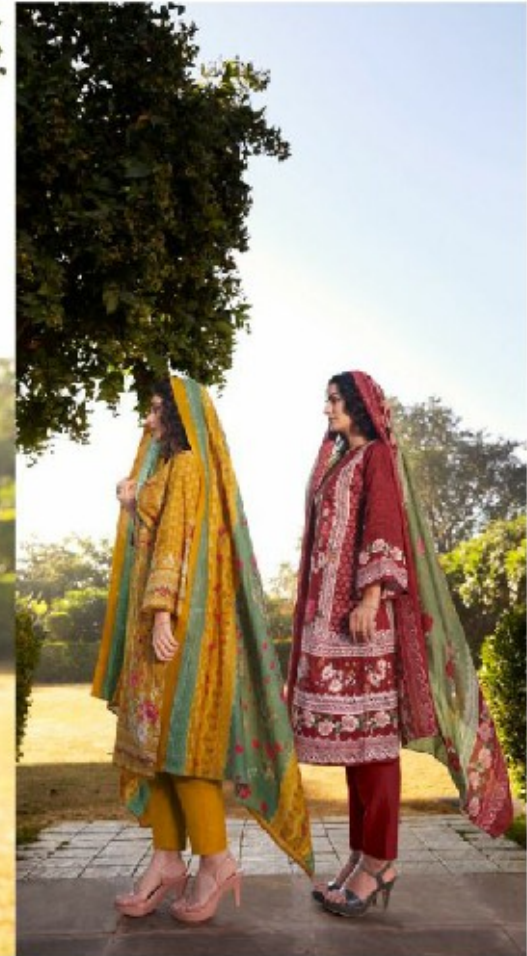
Remains a mystery