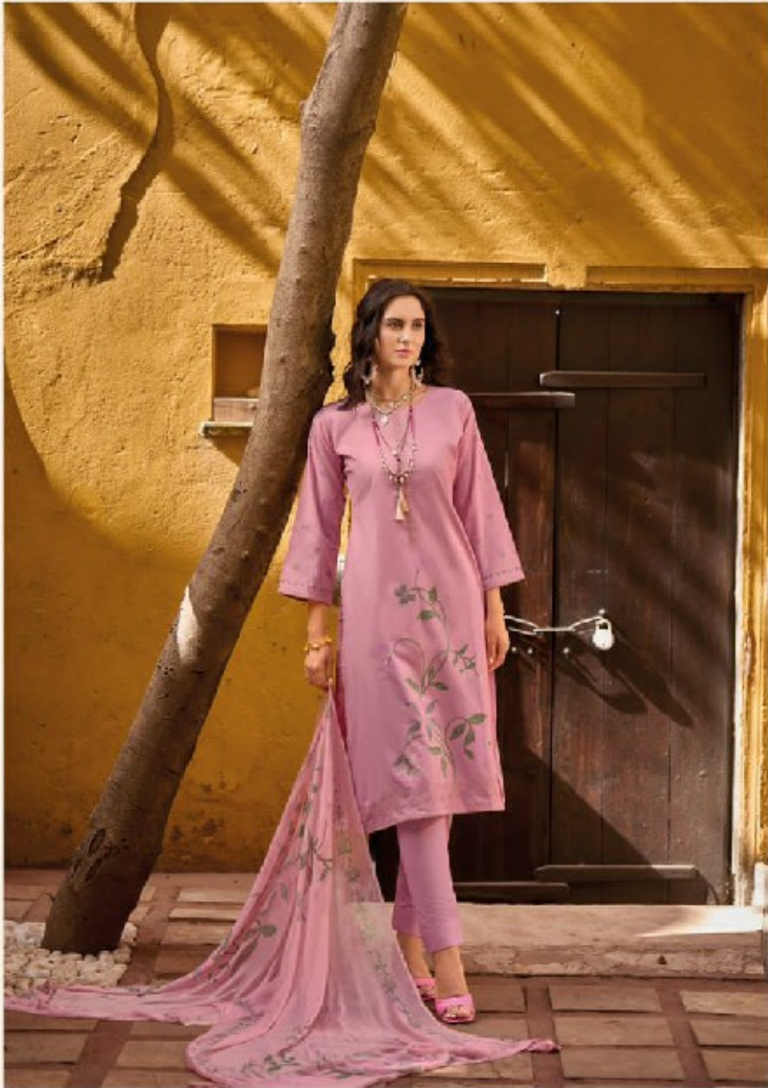
Dress shabbily and they remember the dress; dress impeccably and they notice the woman