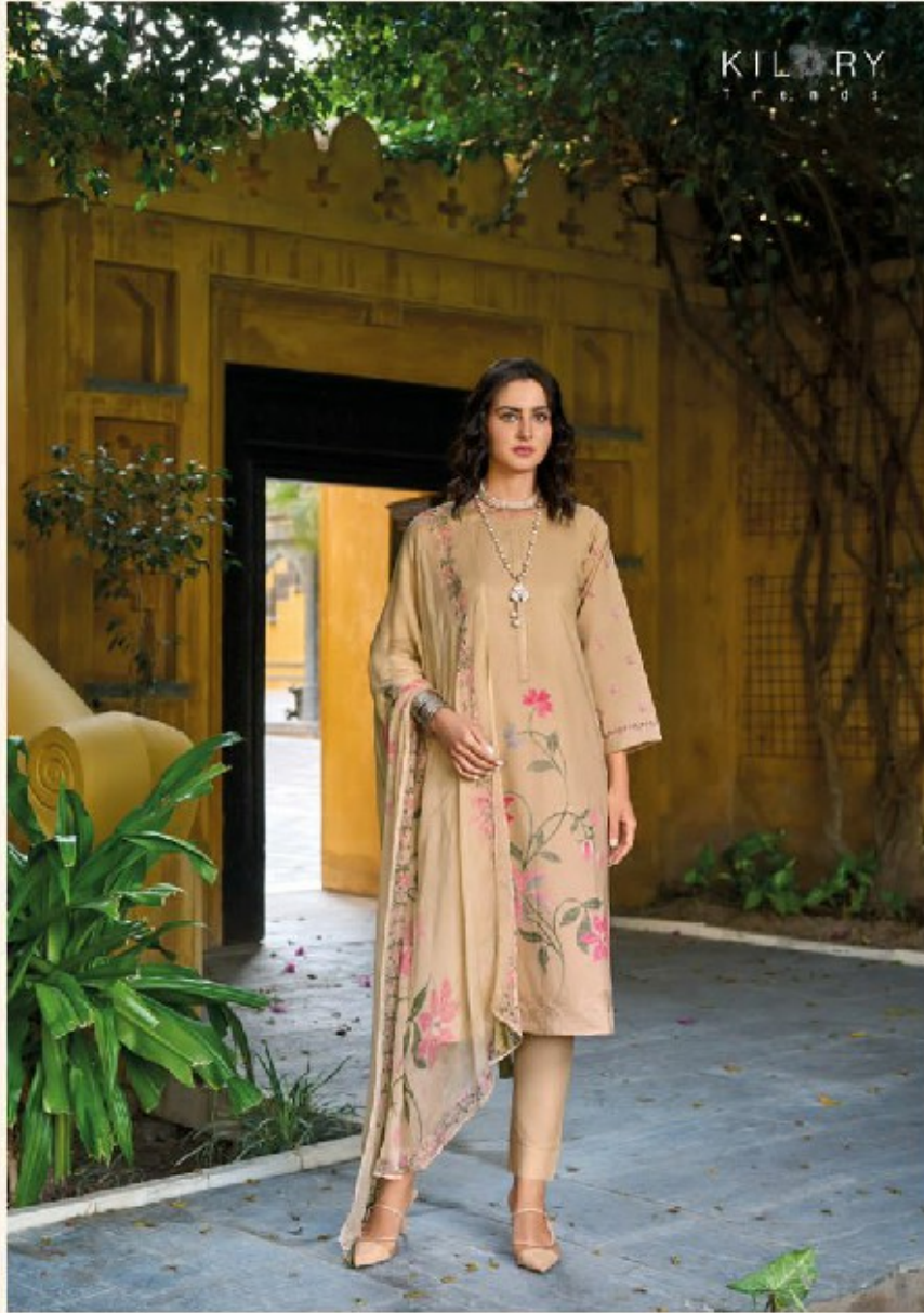
Playing dress-up begins at age five and never truly ends ..... 991