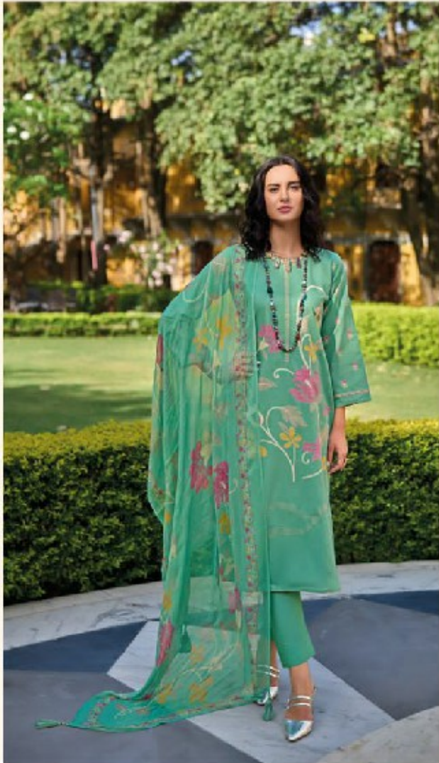
Diversity lasts when it no longer has to be the subject of a story