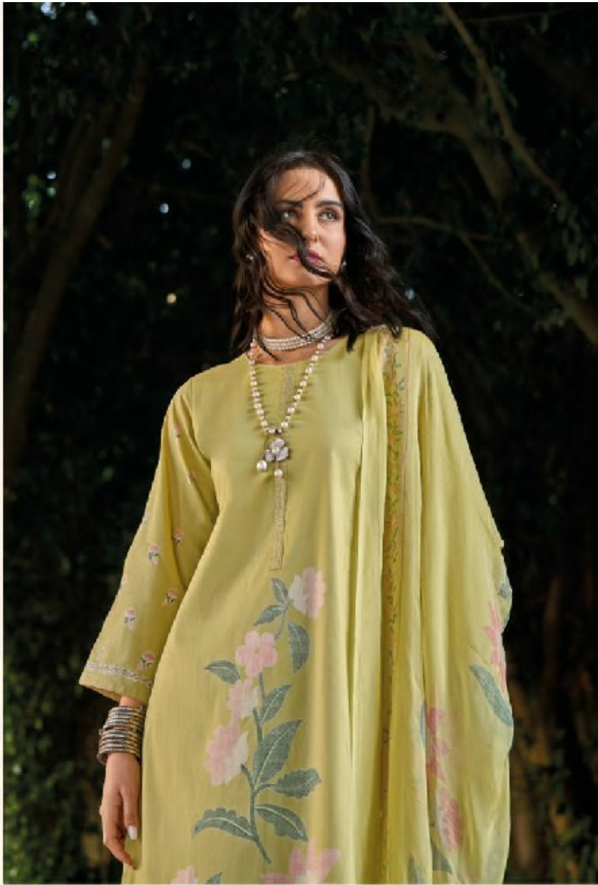
Elegance is not standing out, but being remembered