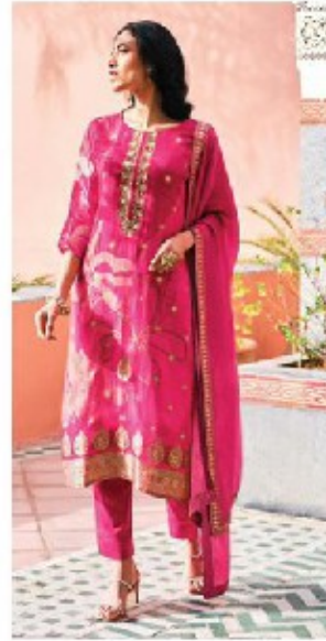
NS - 03