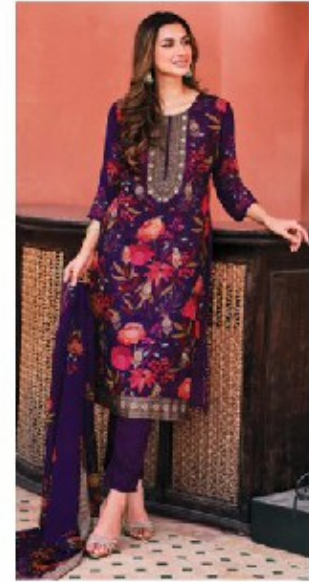
NS - 04