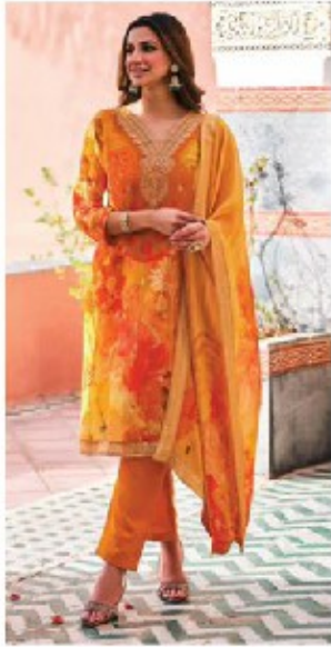
NS - 01