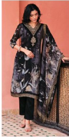
NS - 02