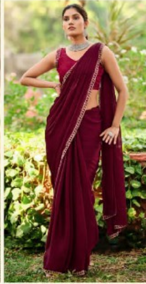
CO DE 1002