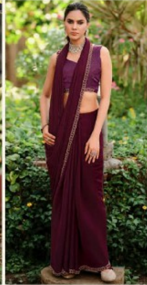
CO DE 1007