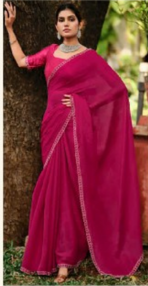
CO DE 1005