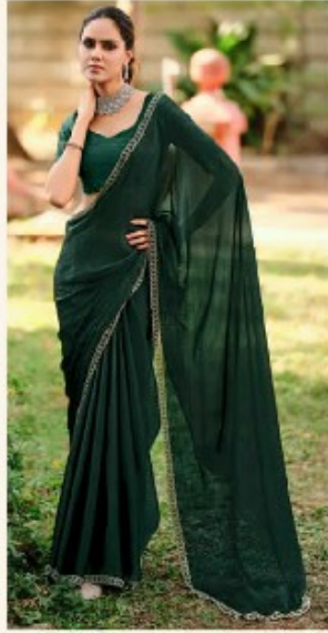
CO DE 1001