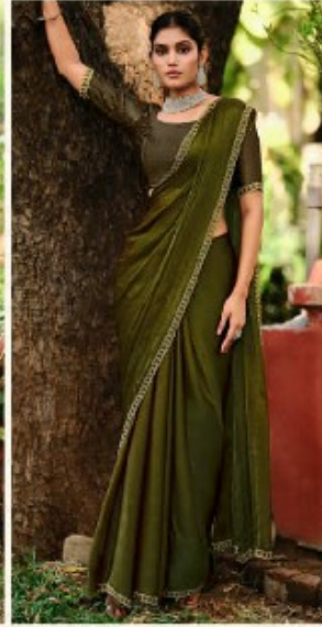
CO DE 1003