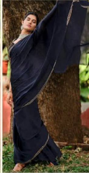
CO DE 1006