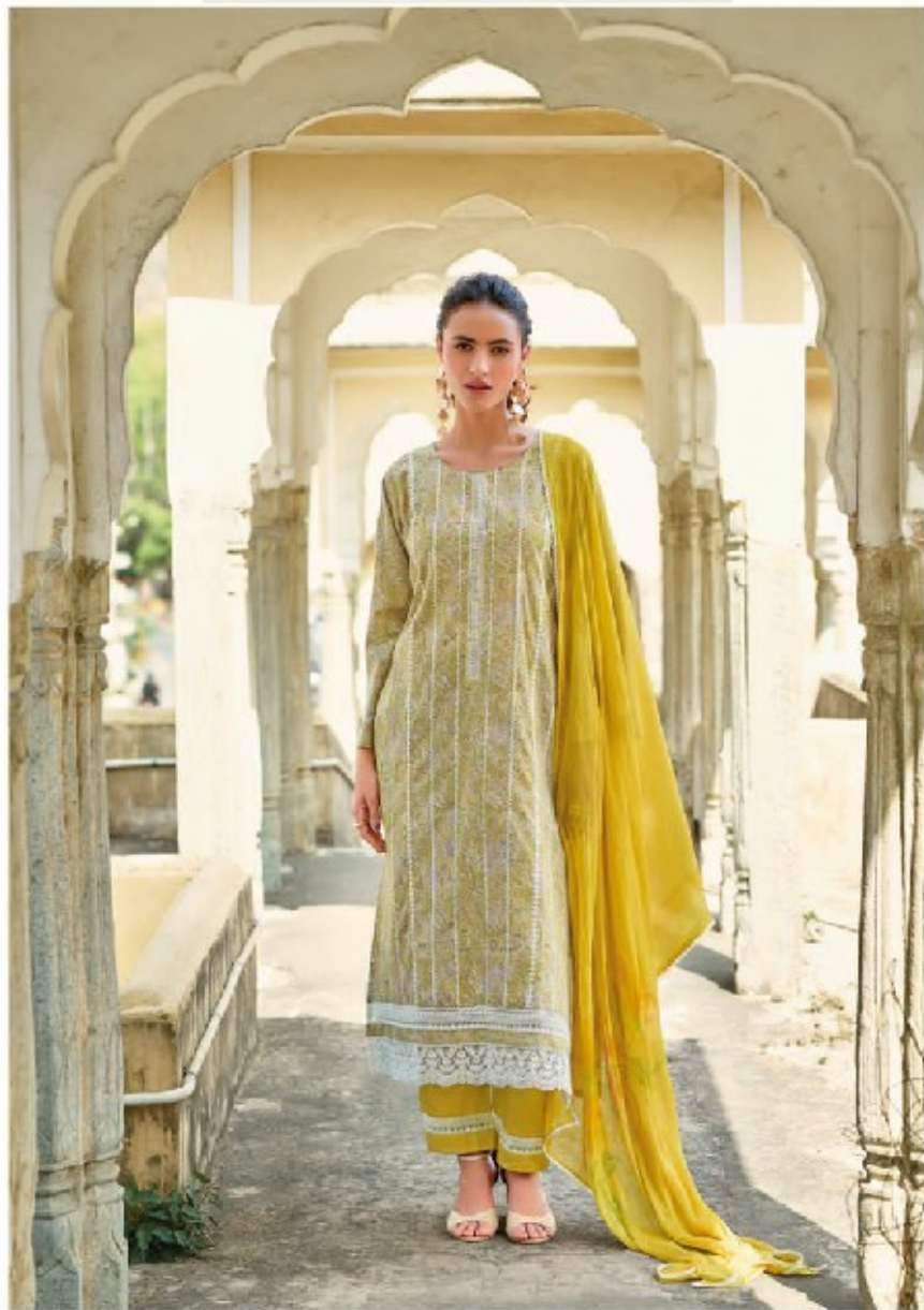
KILORY || 1022