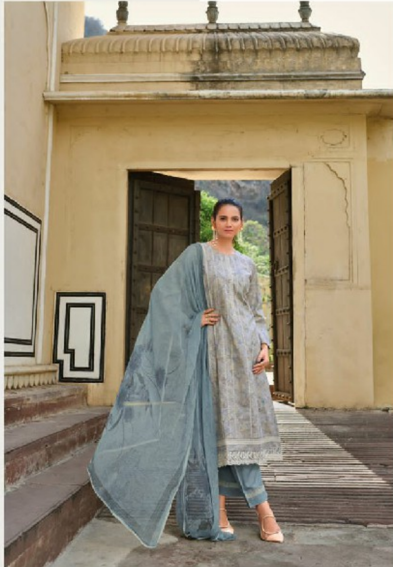
KILORY | 1025