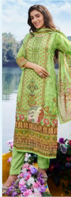
Pretty Petals D.no.3762