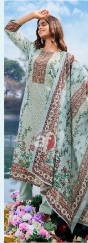
Pretty Petals D.no.3763