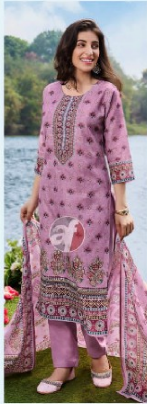
Pretty Petals D.no.3761