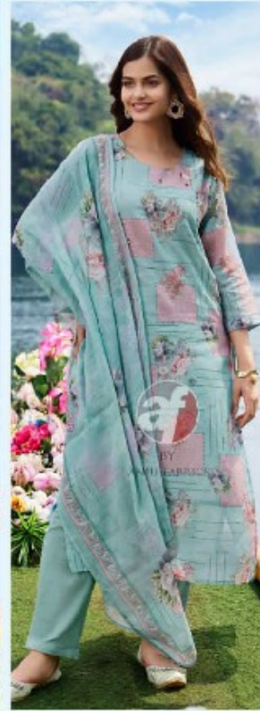
Pretty Petals D.no.3766