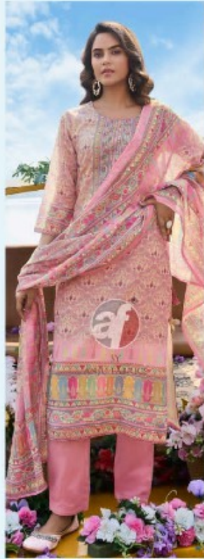
Pretty Petals D.no.3764