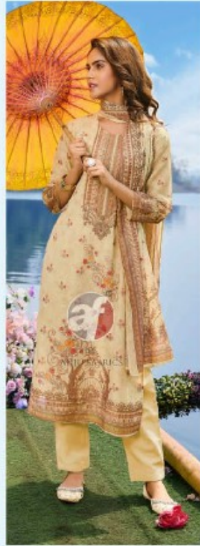
Pretty Petals D.no.3765